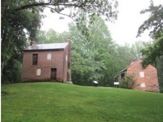
Wm. Richards House (L) and Block House (R) at Oconee Station

Originally a military compound and later a trading post, this Historic Site offers both, recreational opportunities and a unique look at 18th and 19th century South Carolina.