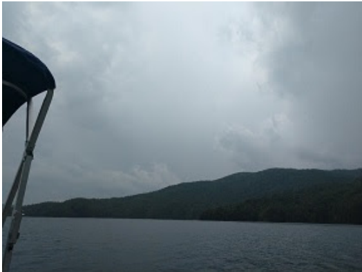
Storm clouds build as the tour heads to the dock...