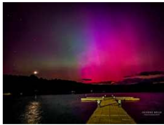
Aurora borealis over Lake Jocassee