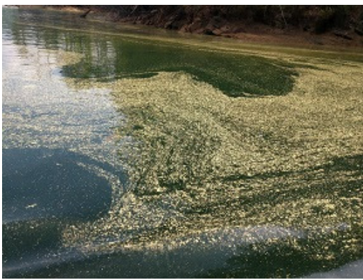
Pollen is thick across Jocassee!