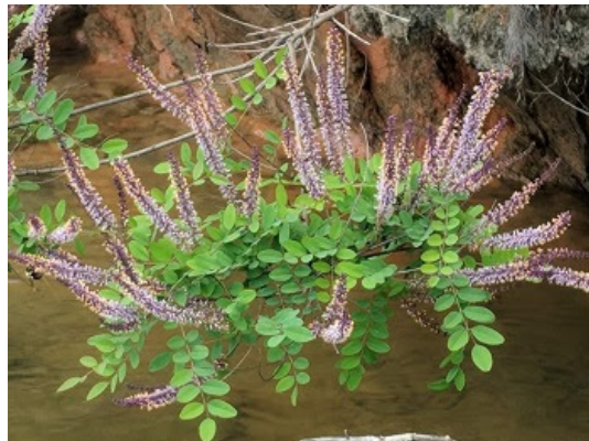
Amorpha glabra, aka False Indigo, blooming over the waters of Lake Jocassee