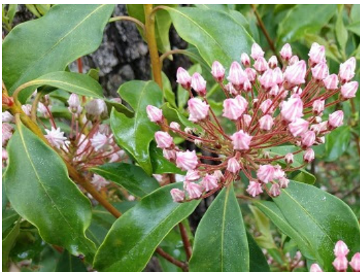
Kalmia latifolia, aka Mtn. laurel, Queen of the flowers!

HIKE AND KAYAK SHUTTLES ARE ALWAYS AVAILABLE! Call 864-290-5501 to plan your adventure!