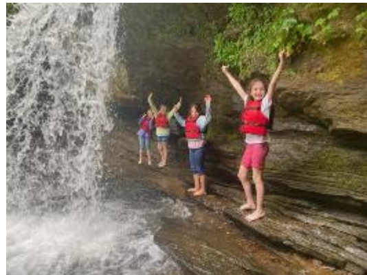
Feeling the joy of Wright Creek!