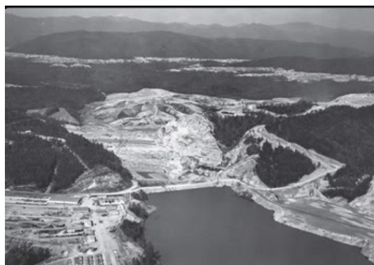
This photo from the Duke Power archives shows clearing on Lake Keowee, and above the dam to the belt of trees cleared around the perimeter of Lake Jocassee.