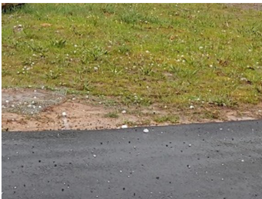
These one inch plus hailstones did a significant amount of damage in a short amount of time!

sounds of trickling streams. Mountain laurel, maple leaf viburnums and gorge rhododendrons were lighting up the shoreline and hillsides. We stopped near a beautiful cascade in Laurel Fork Creek and watched a large bait ball of fish shimmer as it moved through the water. The two common loons, one adult, and one juvenile close by would certainly be sorry to have missed this buffet.