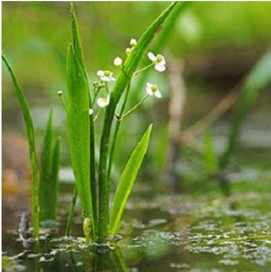
Bunched arrowhead at Blackwell Preserve