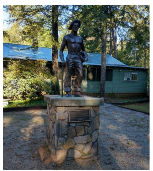
OSP CCC statue

Join our Interpretive Ranger on a guided walk through history. Explore the impacts the Civilian Conservation Corps has made on South Carolina and check out several of our structures built by enrollees.