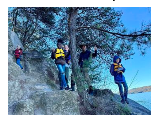
JLT guides have to be a little wild themselves to stay ahead of all these kids!