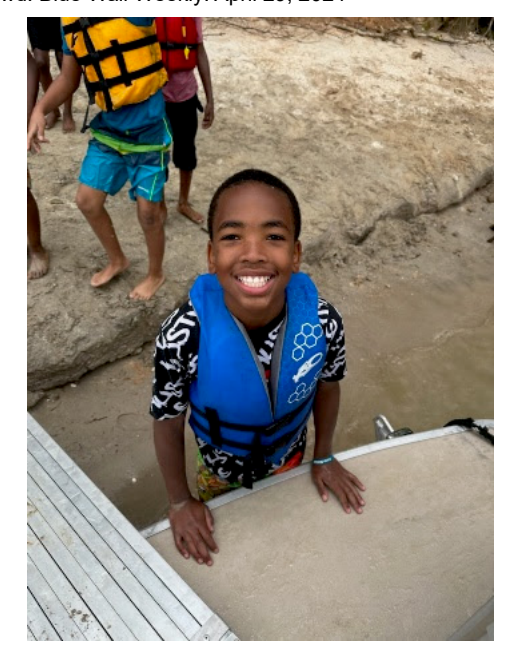
Doesn't this beautiful face say it all?