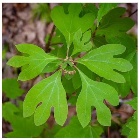
Sassafras albidum Plant a tree! Every day is Arbor Day.