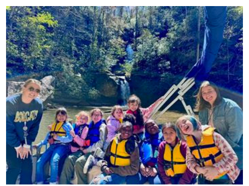
Take the pictures BEFORE they get wet and muddy...