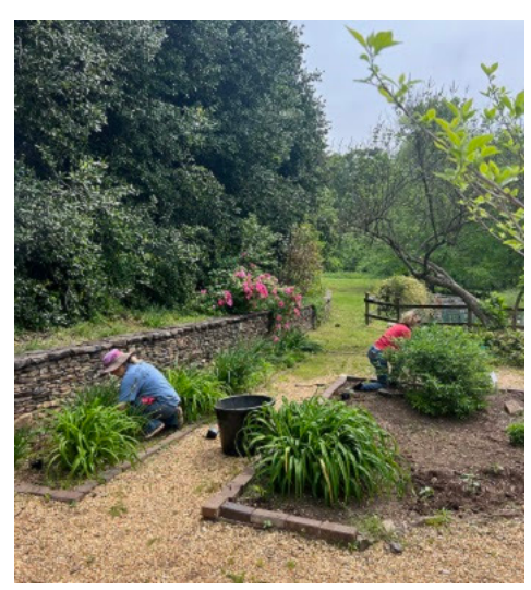
Shout out to all the many volunteers, past and present, who keep the Garden beautiful, THANK YOU!

These tours last approximately an hour and focus on the Garden's history, development, and seasonal highlights.