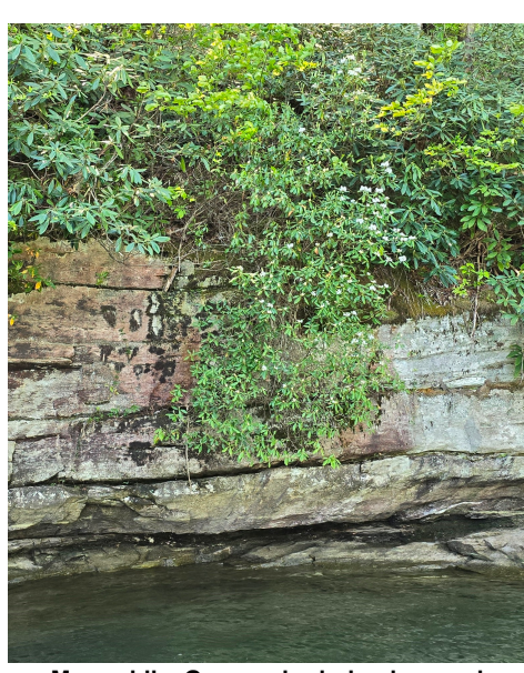
Meanwhile, Gorges rhododendron and Mtn. laurel are coming into their bloom time on Lake Jocassee