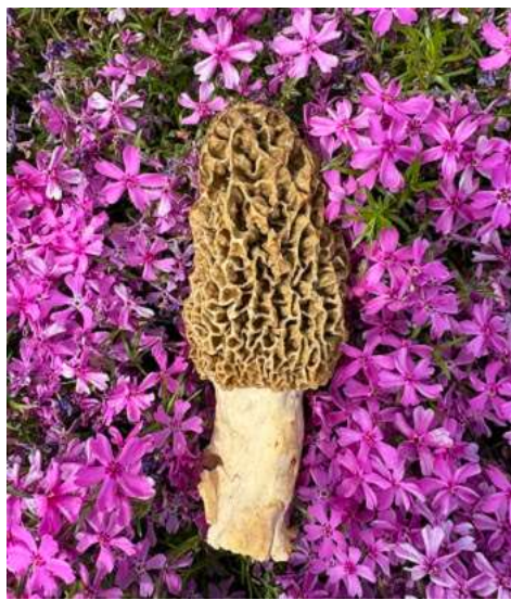
Morchella Morel