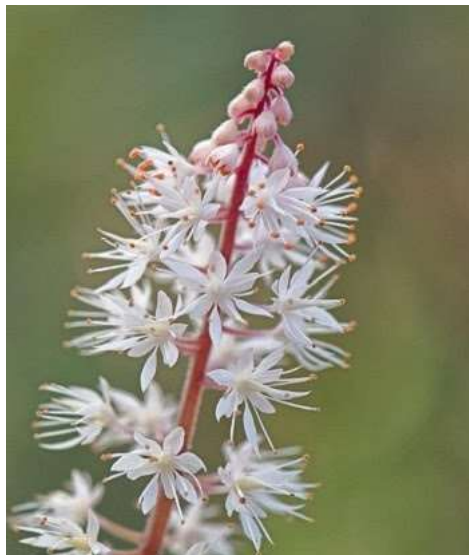
Tiarella aka Foamflower, Photo by Bill Robertson

Join us for a beautiful morning walk around the Lakeside Trail and explore the area in search of native wildflowers. Learn how to identify some of the more common varieties, and maybe snap a photo or two!