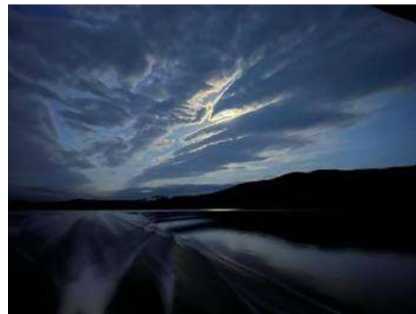
Moonlit evening on Jocassee