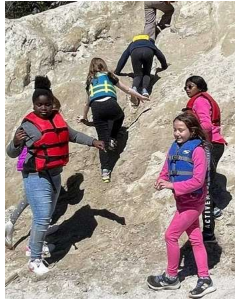
A recent Wild Child outing with Blue Ridge Elementary

Your support makes Jocassee Wild Child Adventures happen!