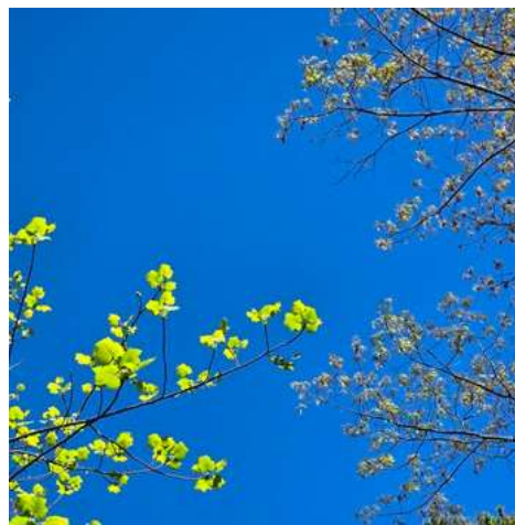
These youngsters are much prettier than the ones with broken limbs!

balance. We'll be scanning for widow makers—broken limbs that dangle precariously from other limbs—and giving the side-eye to trees leaning precariously towards Jocassee Lake Road. It will take another four decades, and another four after that, before these woods regain some semblance of a healthy forest, and a century beyond that before the ecology is truly restored. Happily, this land is owned by a conservancy that will protect it, and someday, there will be old trees living here again. ~K