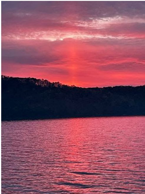
Loonrise.

CALL OR BOOK ONLINE TO RESERVE SEATS www.jocasselaketours.com