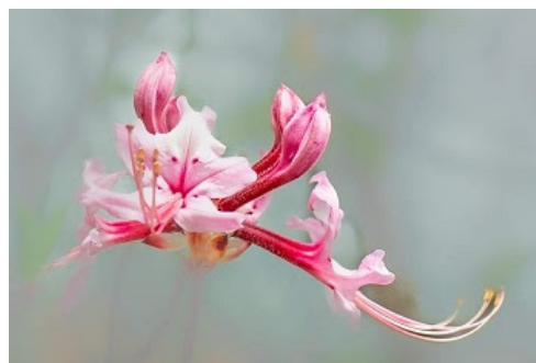
Native azalea