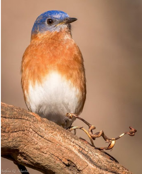
Eastern bluebird