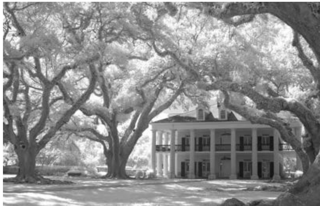
Photographic Art Ray Baker Point Clear, Alabama "Oak Alley Infrared"