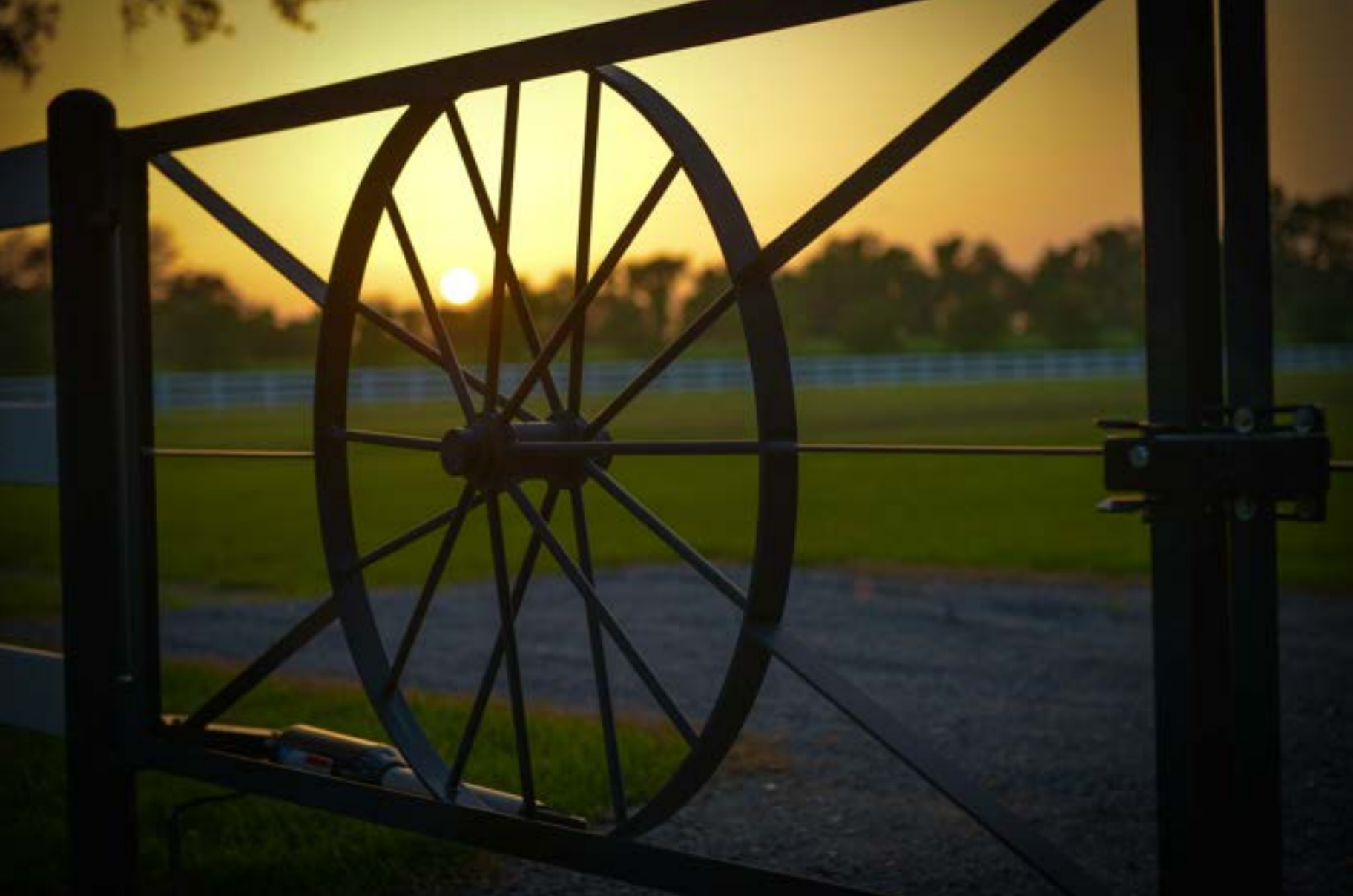
Photographic Art ~ Third Place Richard Brummer Kellyville, Australia "Contemplation"