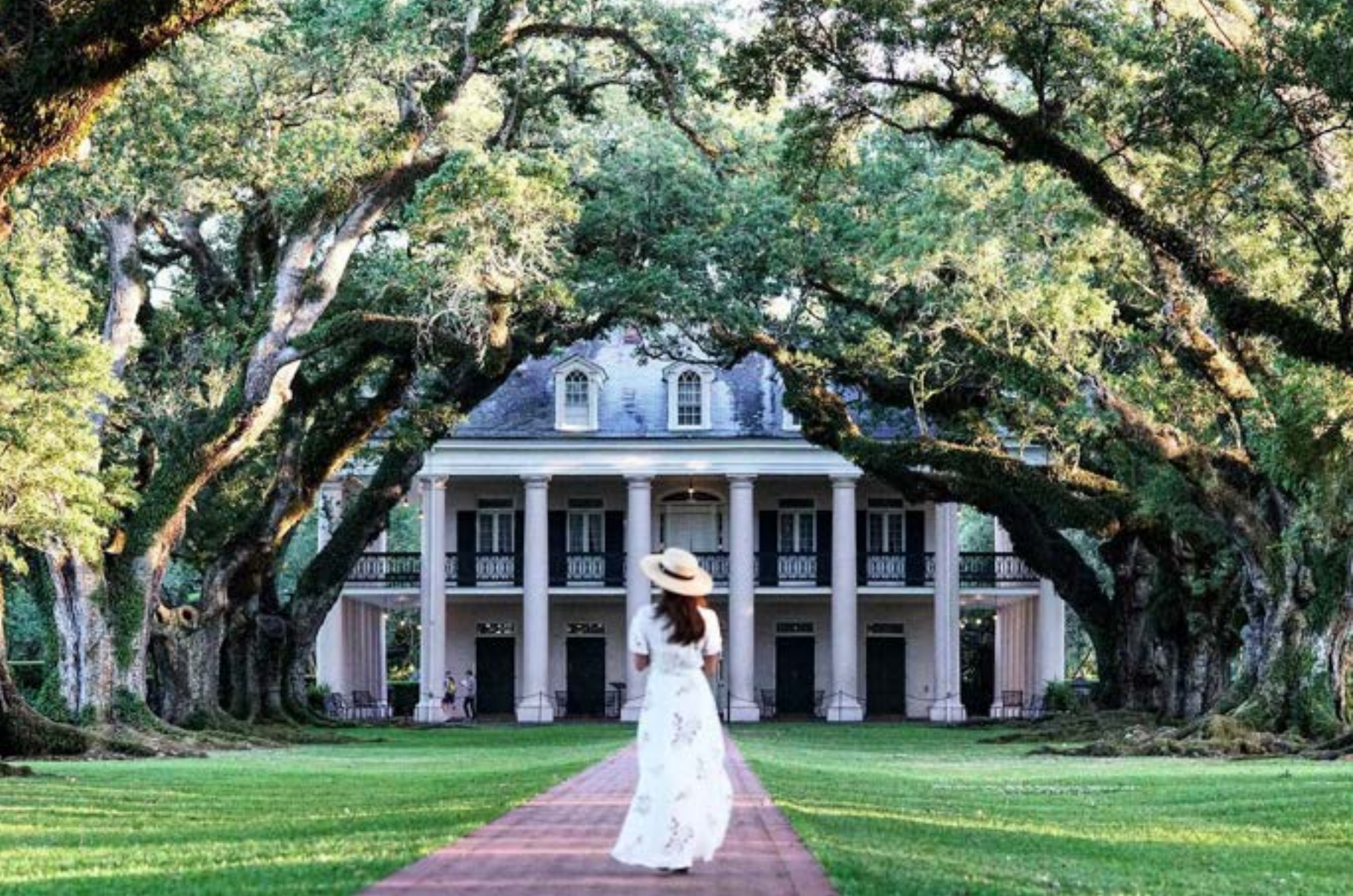
Amateur ~ First Place Will Borne New Orleans, Louisiana "My View Of Oak Alley"