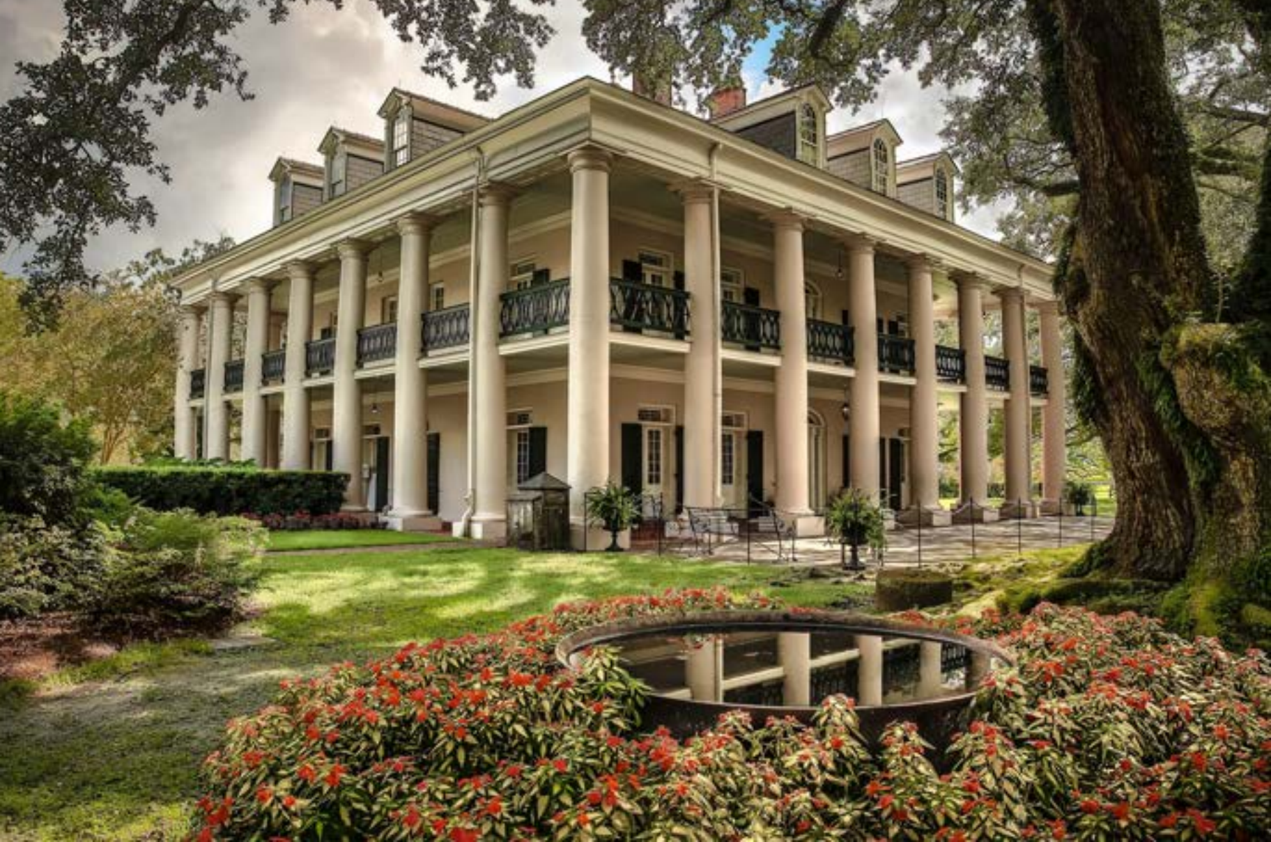
Photographic Art ~ First Place Jeff Hebert Prairieville, Louisiana "28 Columns.... 28 Oak Trees"