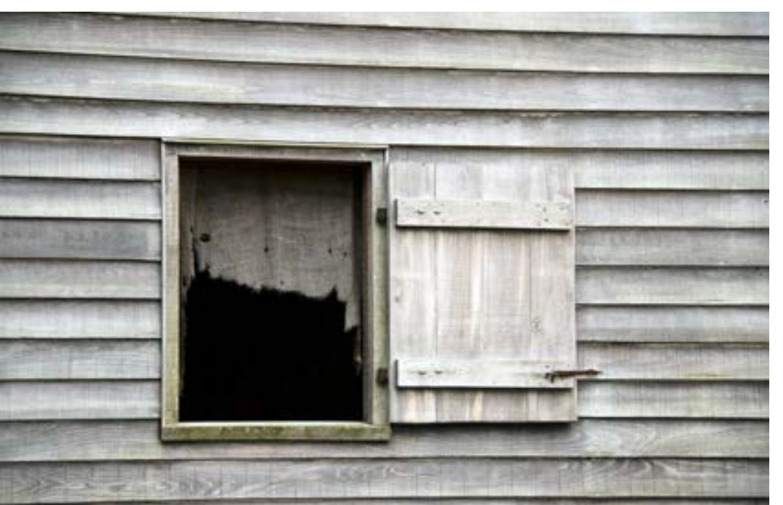
Donna Steen Tempe, Arizona "Outside Looking In"