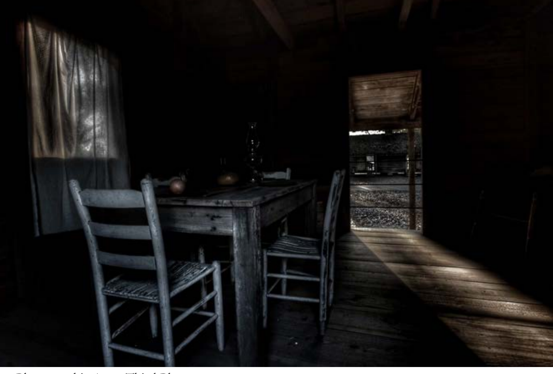
Photographic Art ~ Third Place Keith Thompson Slidell, Louisiana ~ Untitled