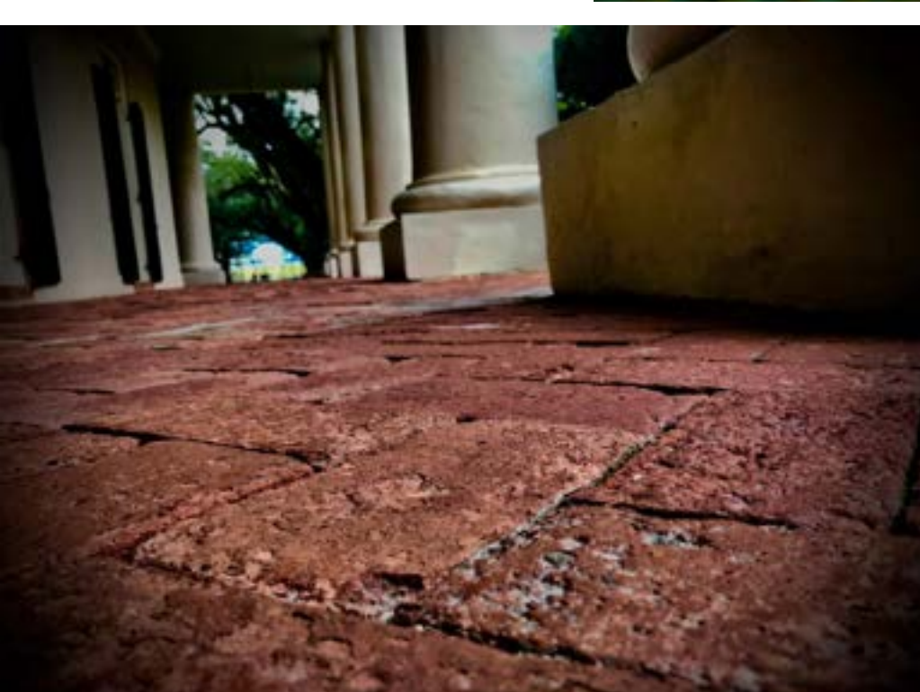
Austin Jaksa Horseshoe Bay, Texas "From the Ground Up"