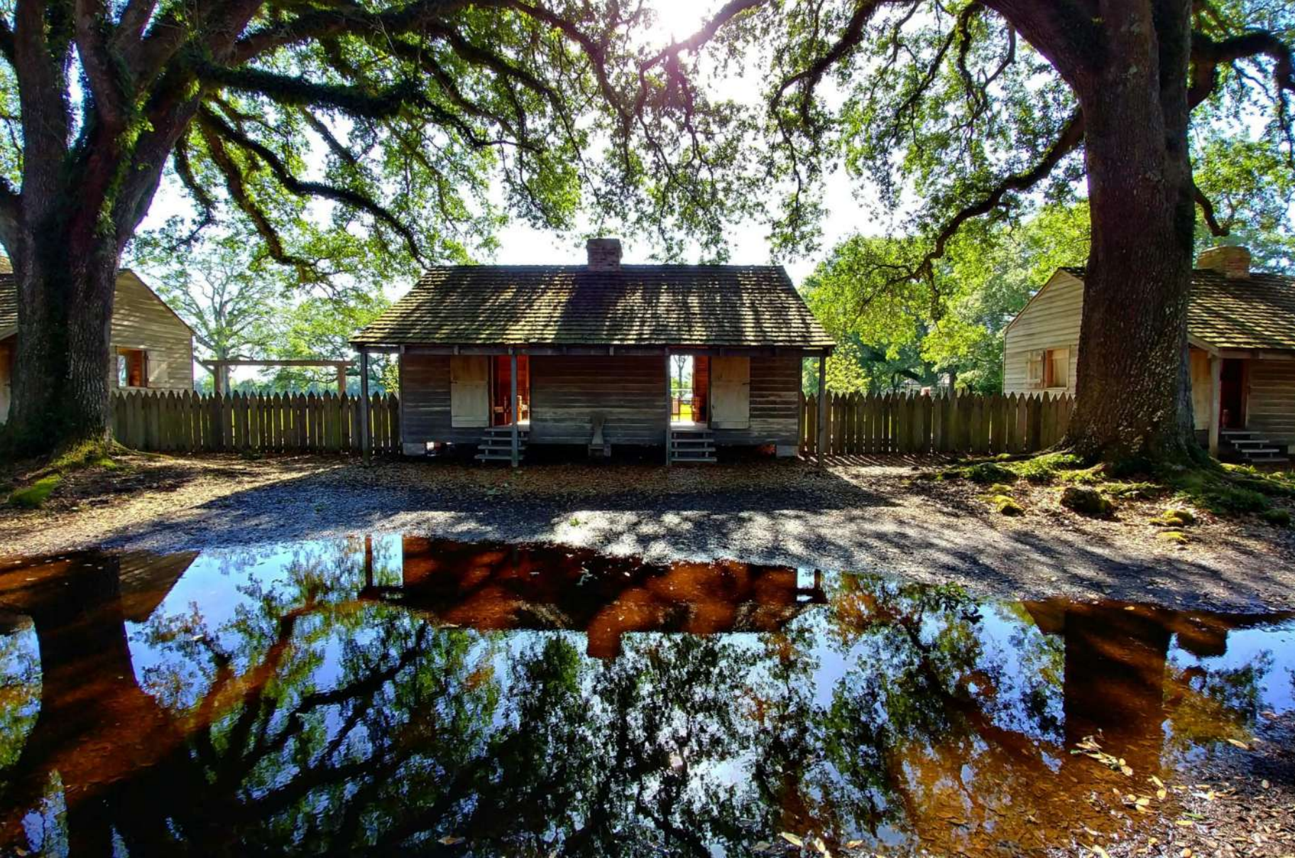
Architecture ~ 3rd Place Megan Swearingen Washougal, WA “Reflections of Slavery”