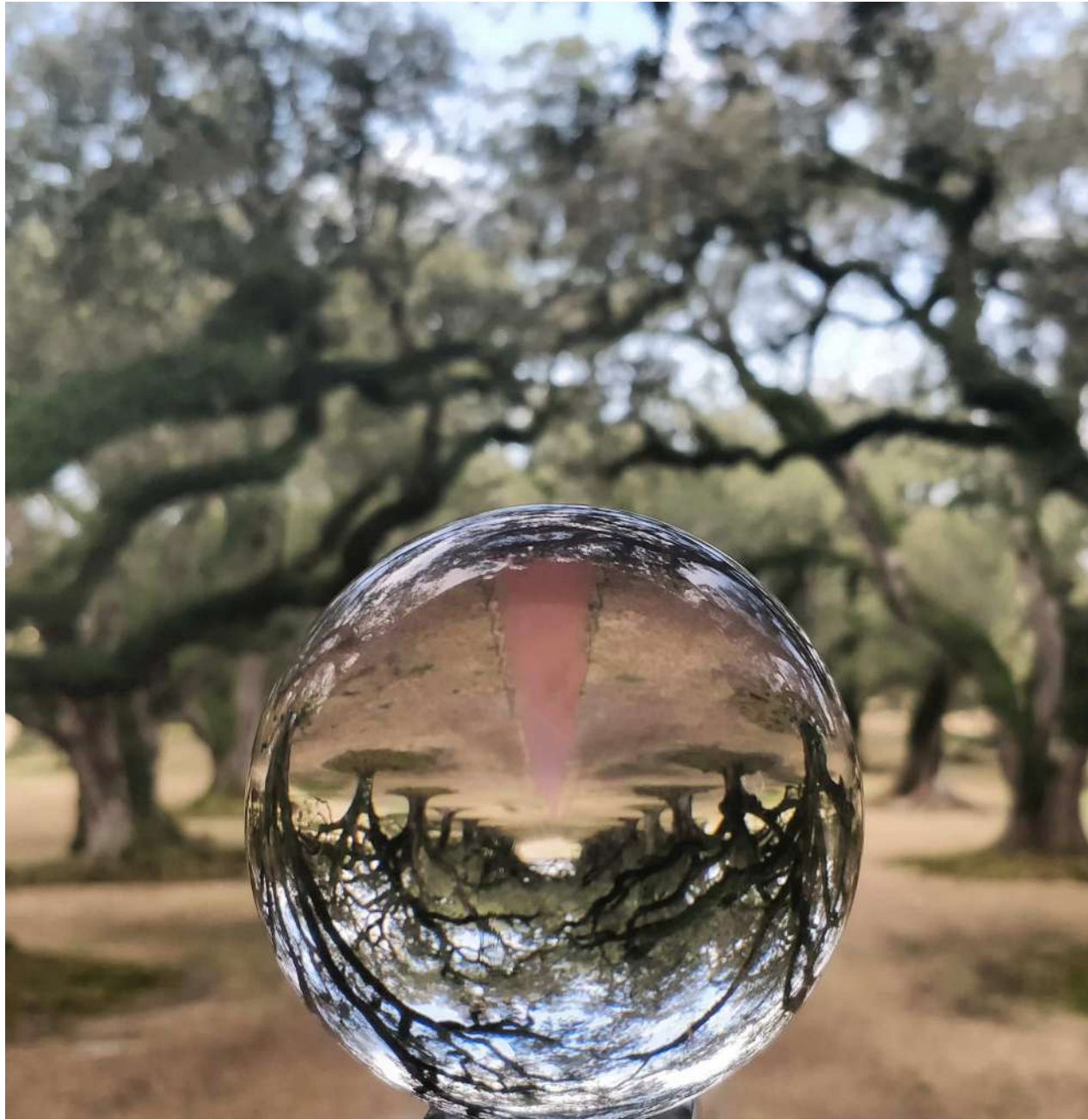
Photographic Art ~ 3rd Place Yael Jolie Noy Holon, Israel “Through the Looking Glass”