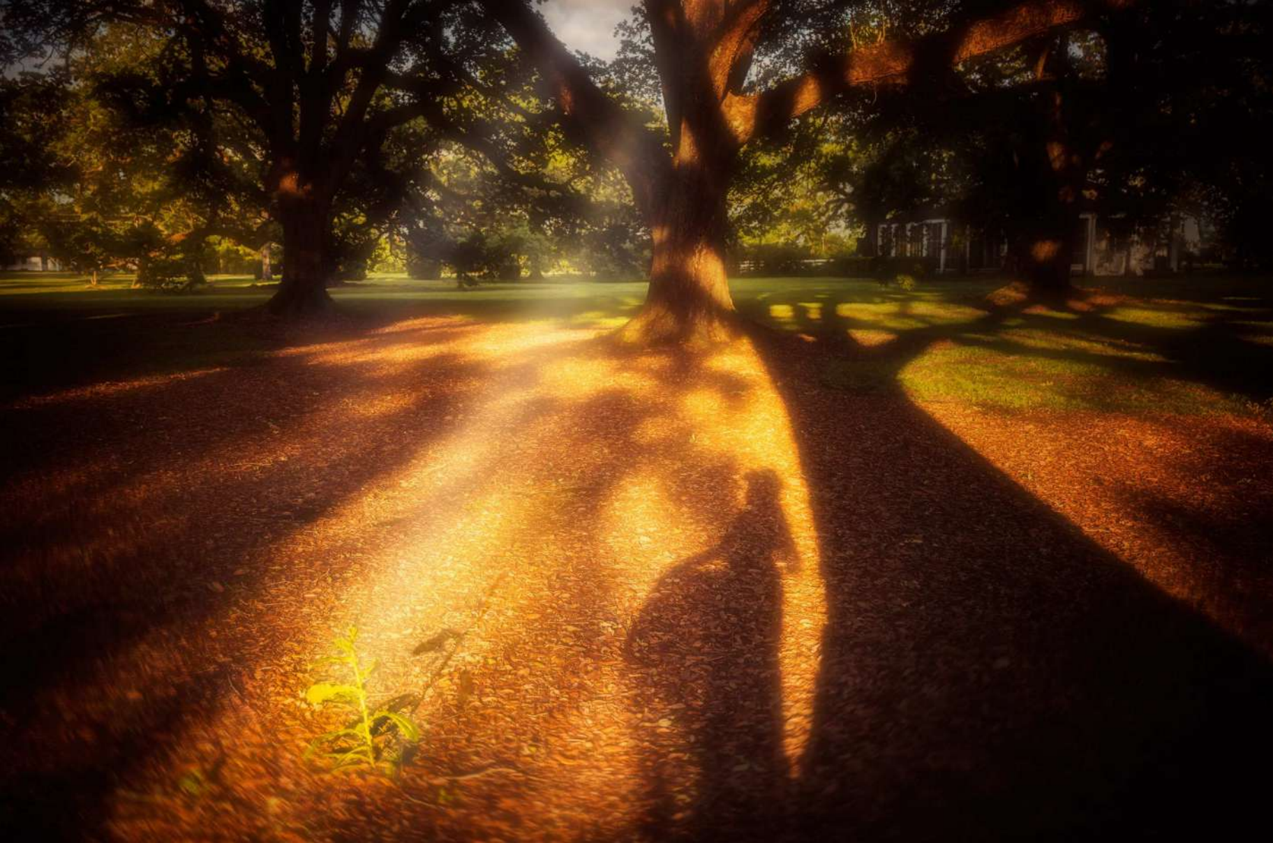
Photographic Art ~ 2nd Place Astrid Ji New York, NY “Conversation”