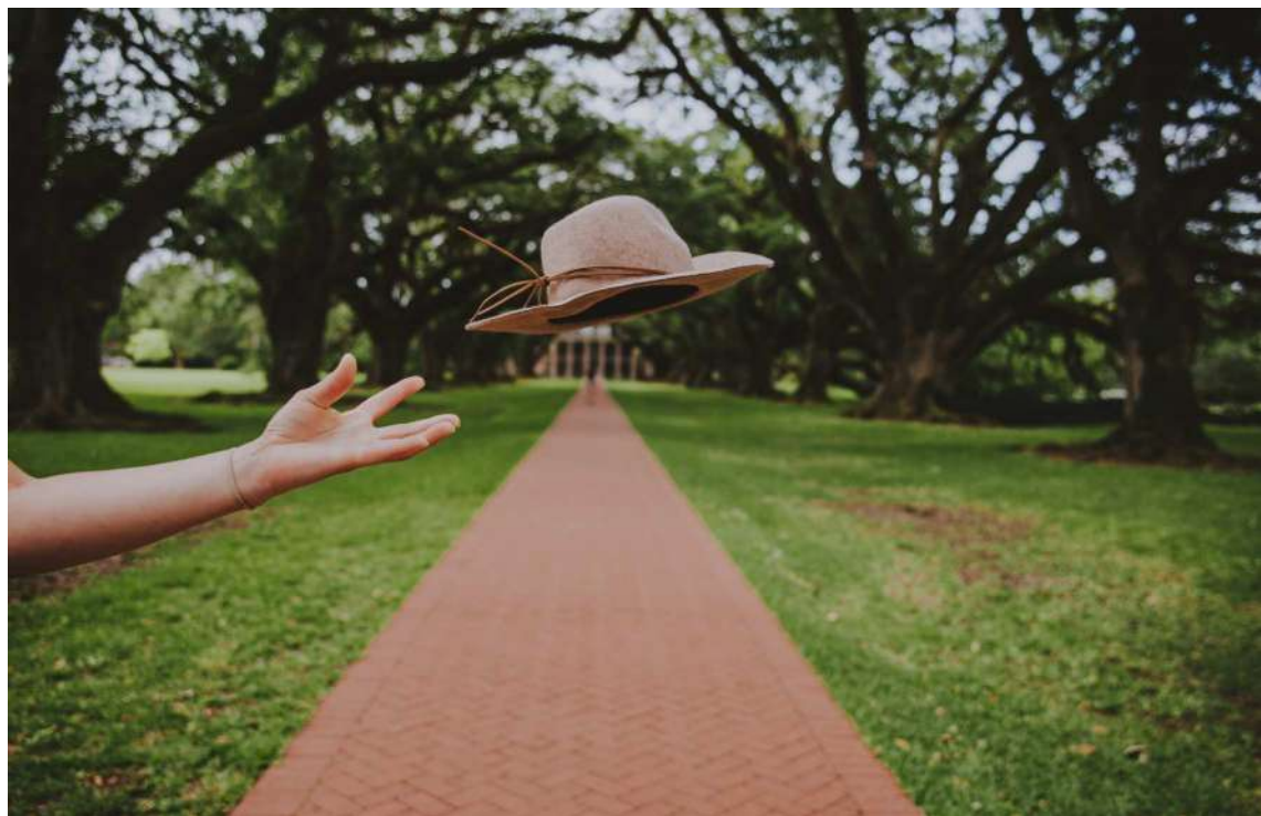
Photographic Art Emily Lazusky Toss Up