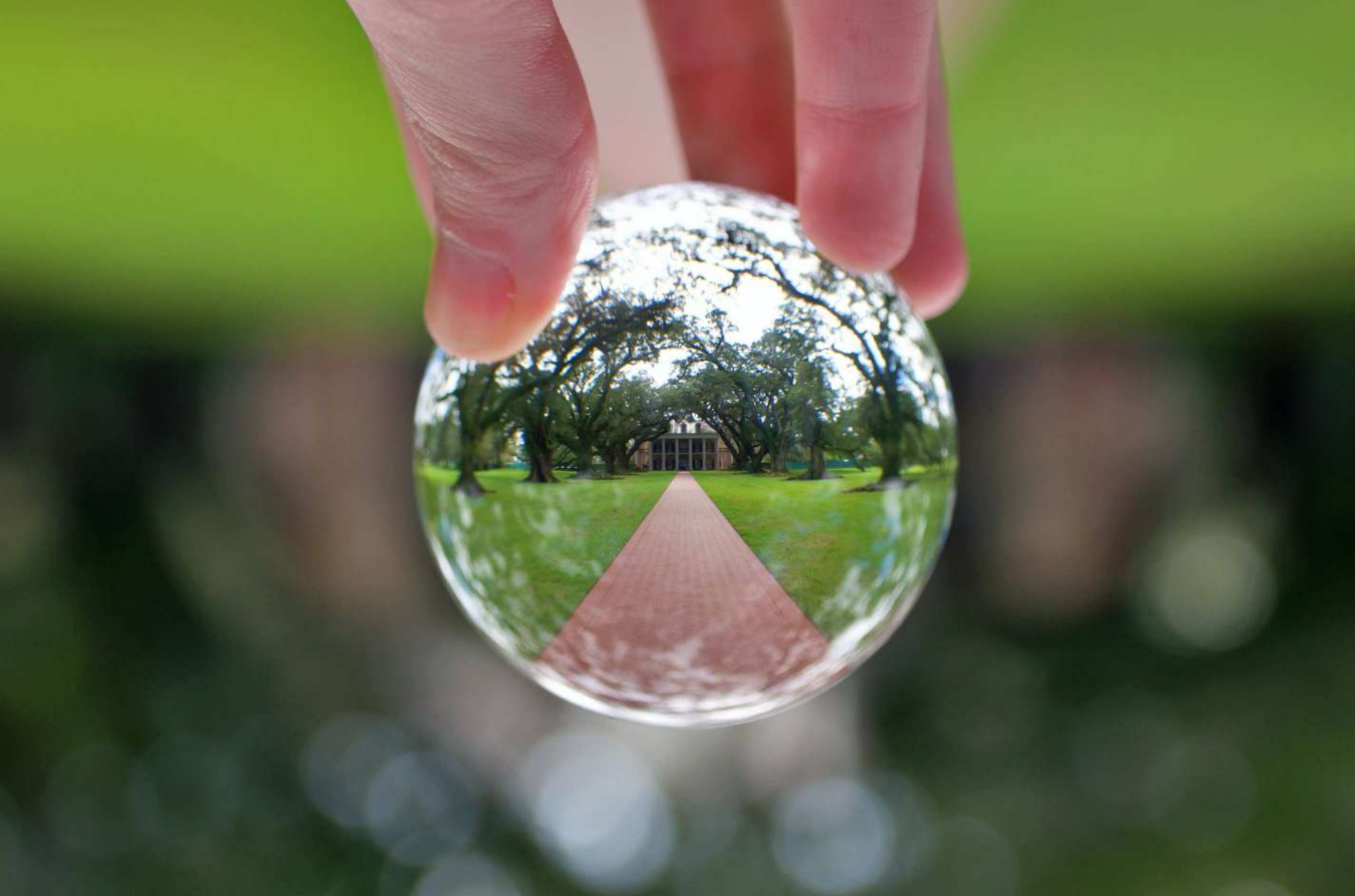
Photographic Art ~ Honorable Mention Amber Wise Ponchatoula, LA Big House in Ball