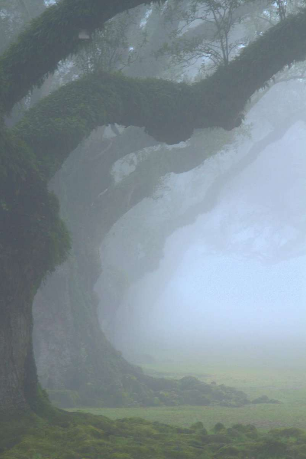
Landscape & Nature ~ 1st Place Lanette Vanwagenen East Lansing, MI Foggy Oaks