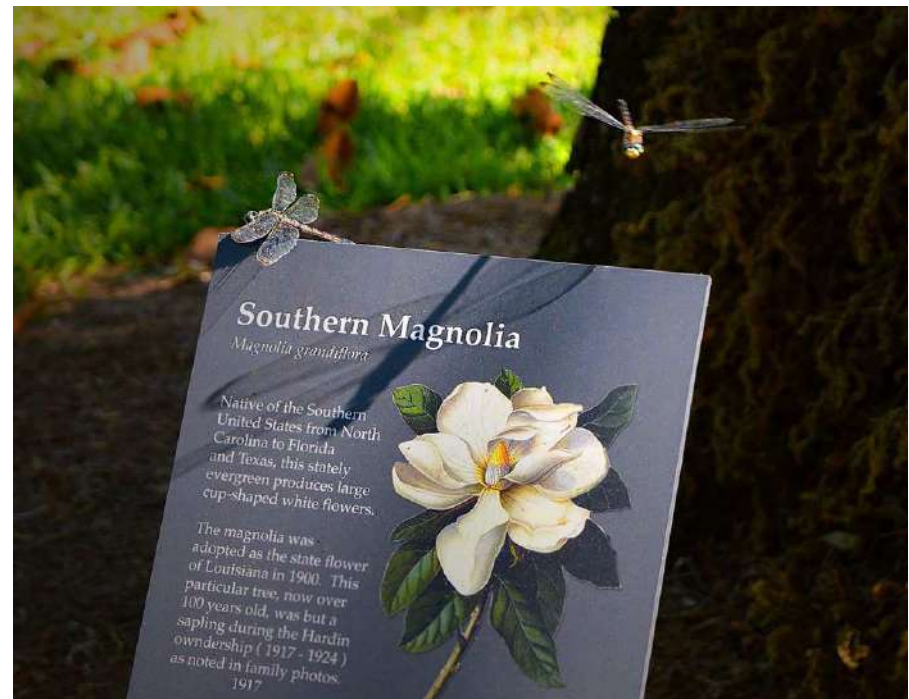
Landscape/Nature Linda Collums Dragonfly Times Two