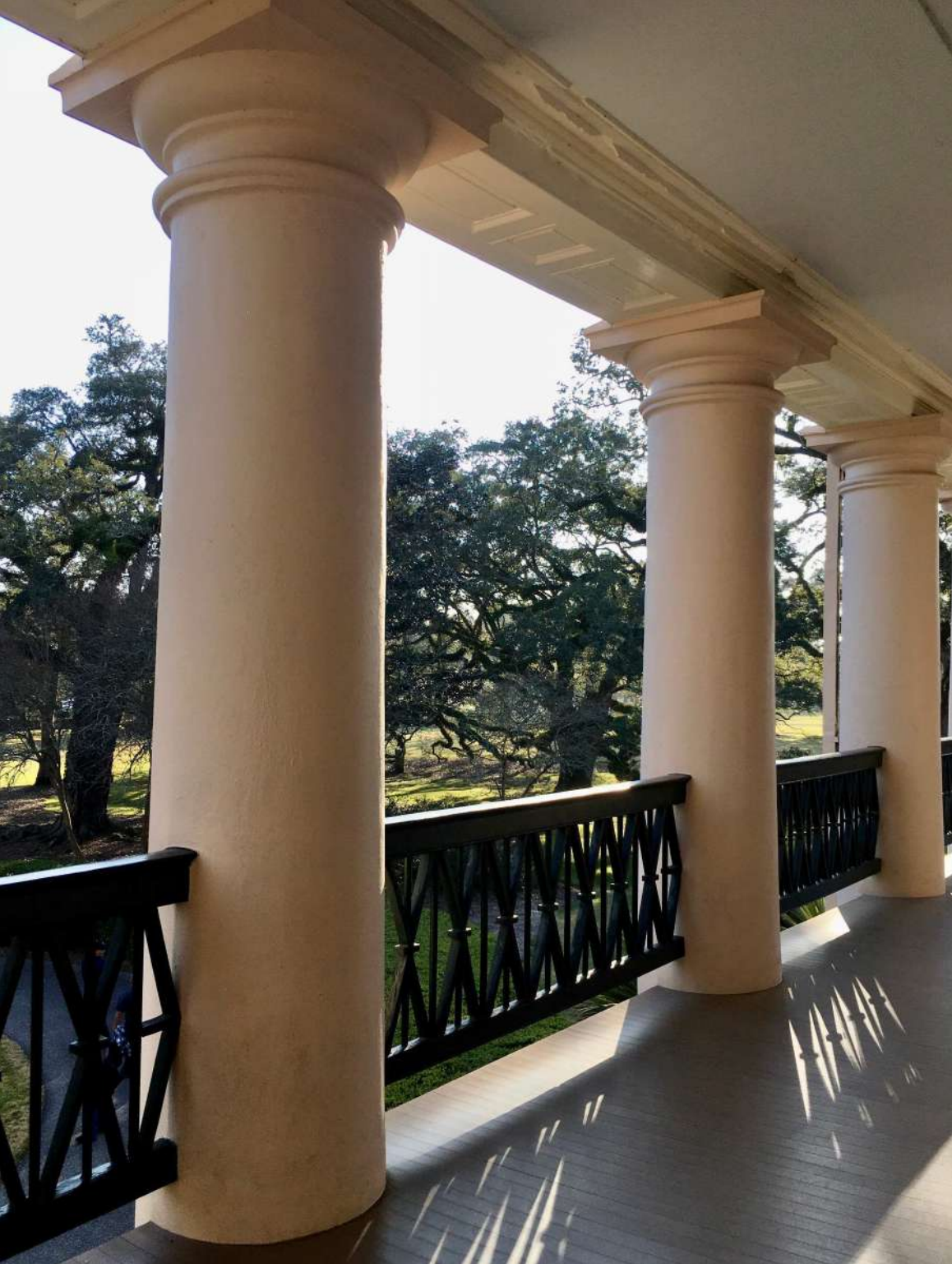
Architecture ~ 1st Place Brody Clark Bellingham, WA Columns