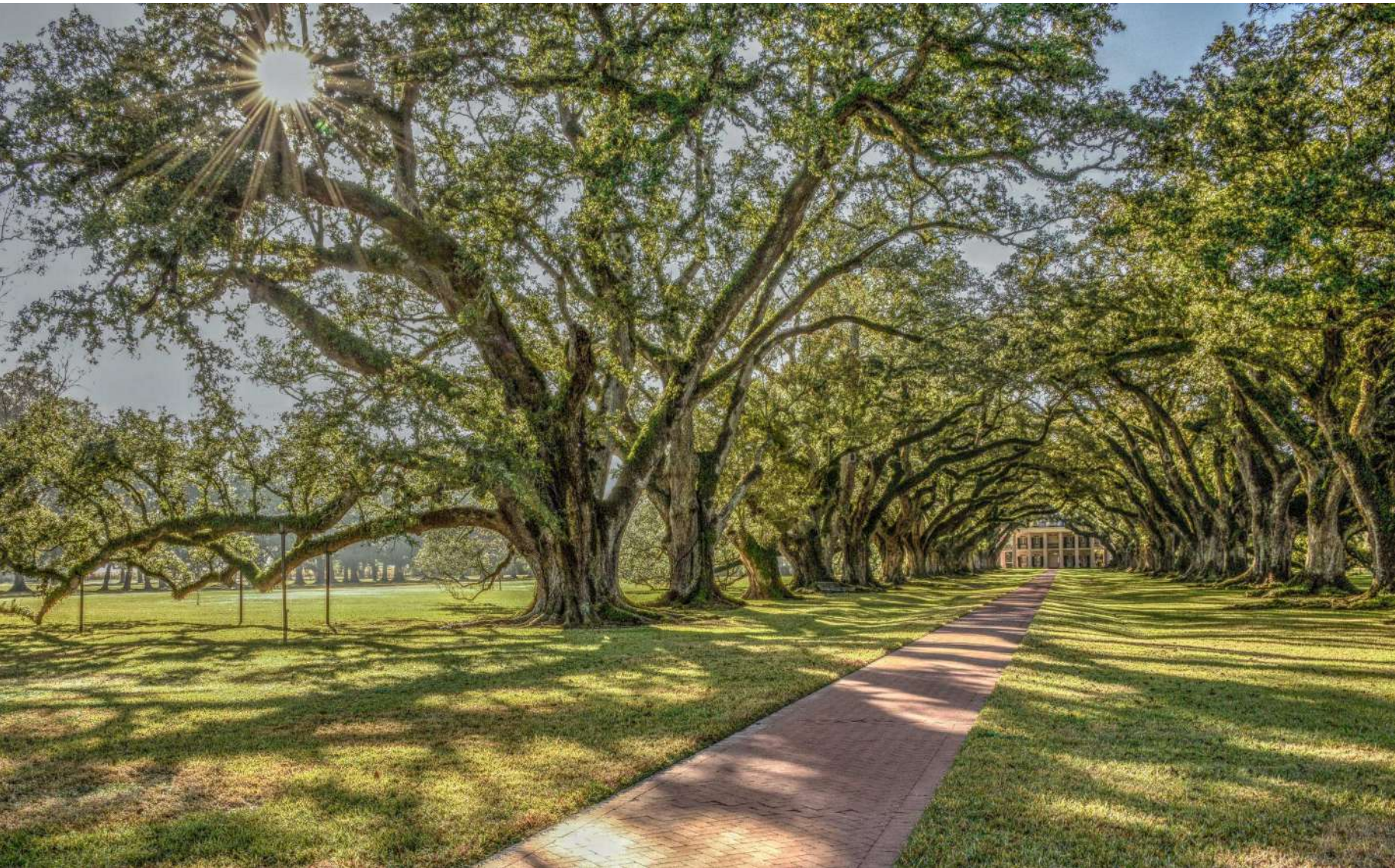
Photographic Art ~ 3rd Place Mona Herbert Gonzales, LA Sunrise at Oak Alley