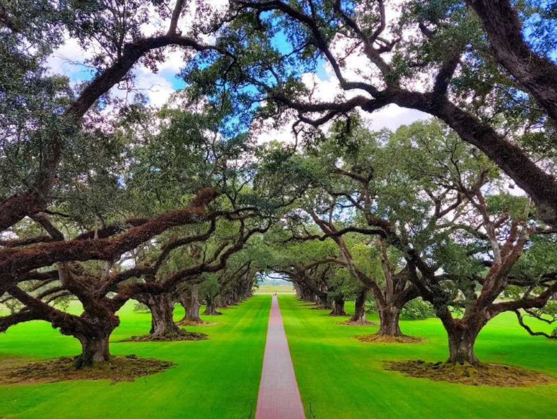
Landscape/Nature Tristin English Came With A Price