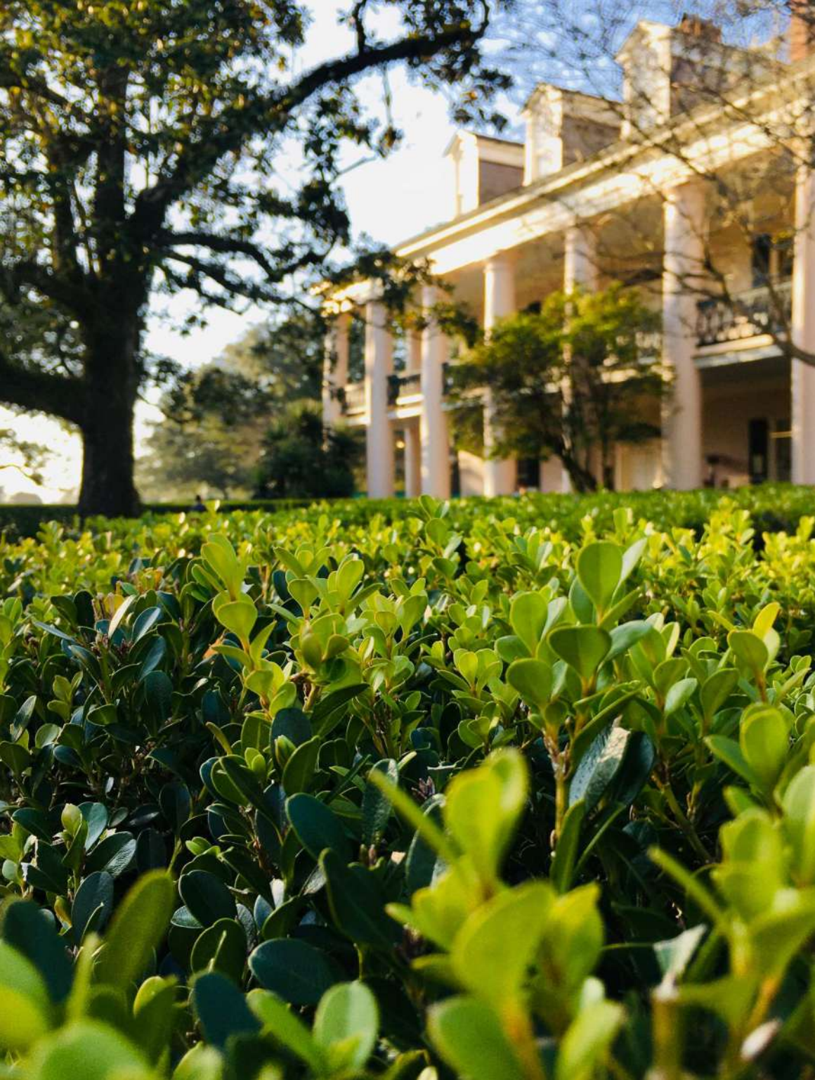
Landscape/Nature Brody Clark Corner House