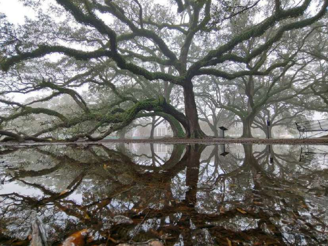
Landscape/Nature Charlotte Brooks Reflective Moments