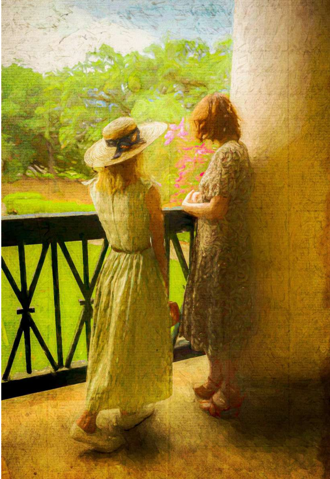
Photographic Art ~ 2nd Place Wayne M. Brodd Sugar Land, TX Summer Blooms