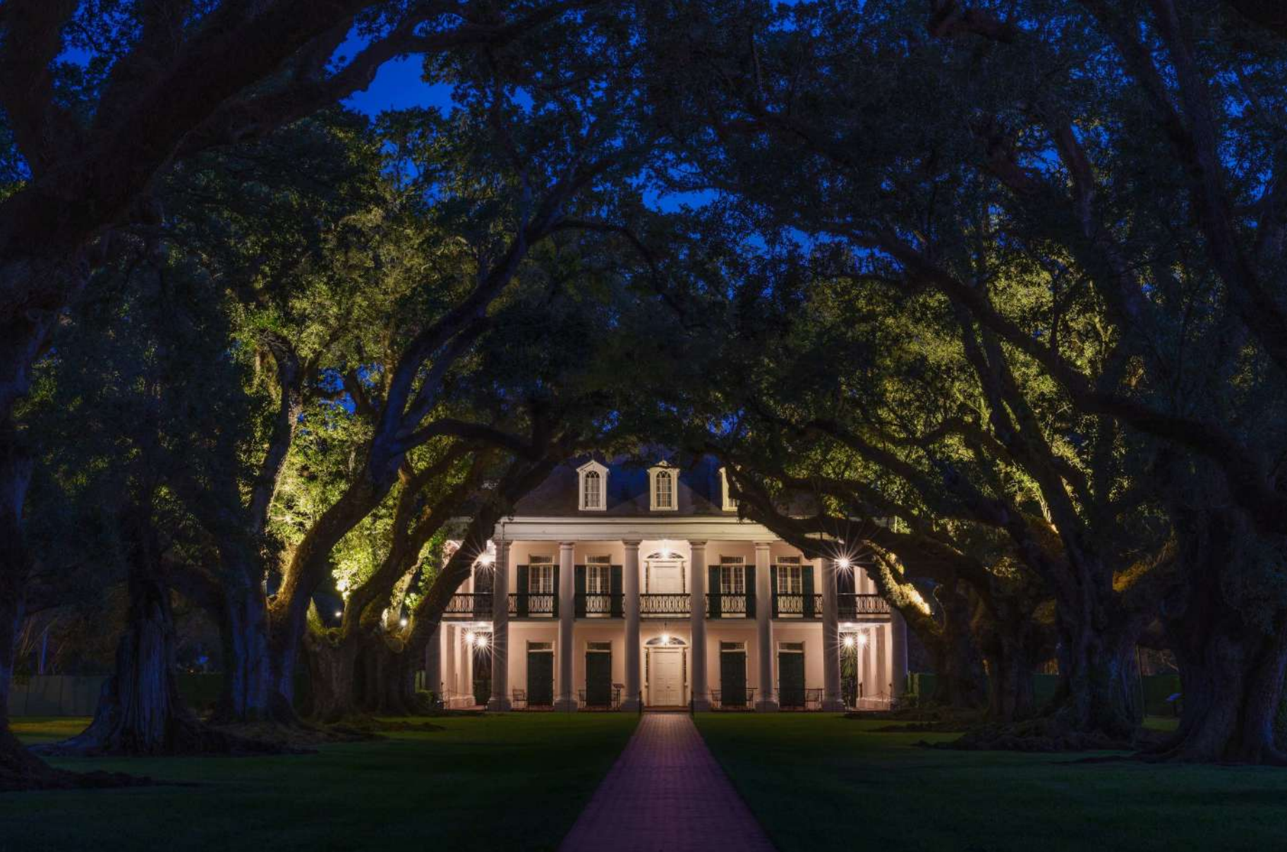
Architecture ~3rd Place Sylvia Bothmer Germany Peaceful Blue Hour