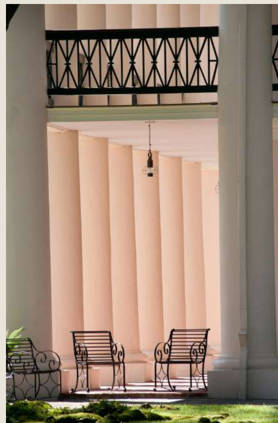
MICHELE NUNES "COLUMNS"