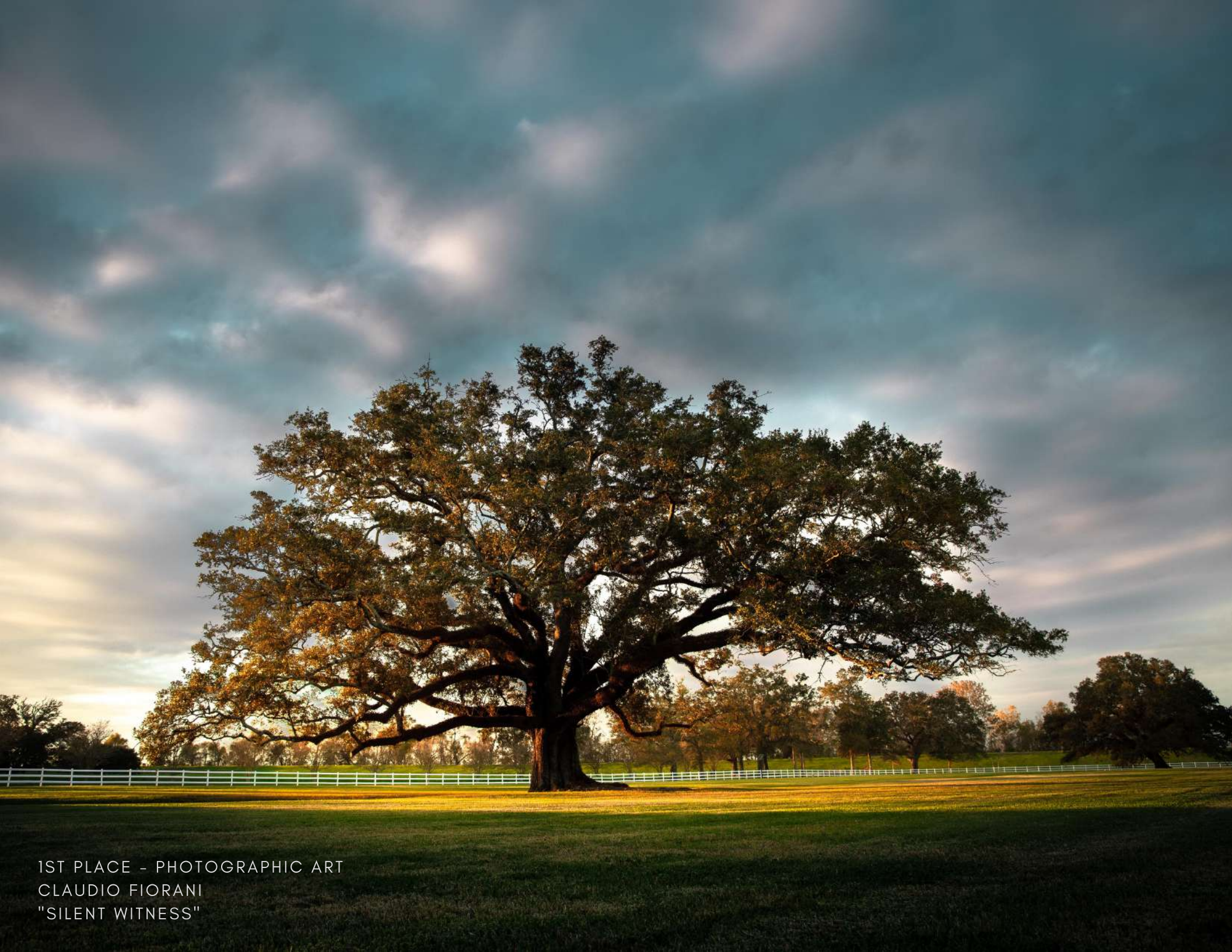
1ST PLACE - PHOTOGRAPHIC ART CLAUDIO FIORANI "SILENT WITNESS"