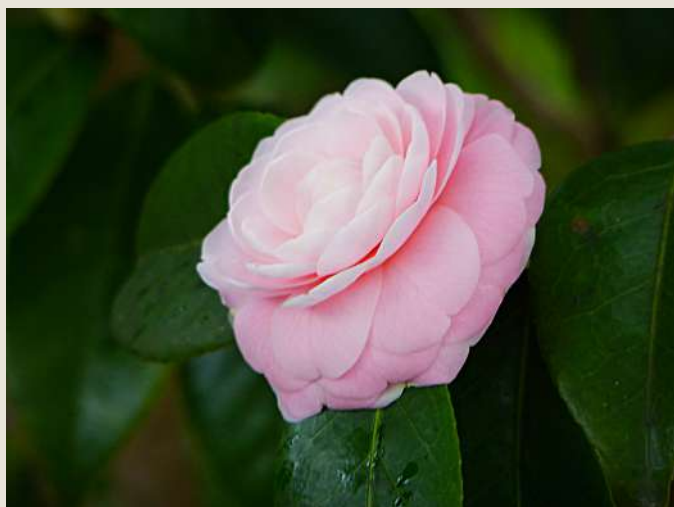
JOLENE KNAPP "PERFECT PINK CAMELLIA"