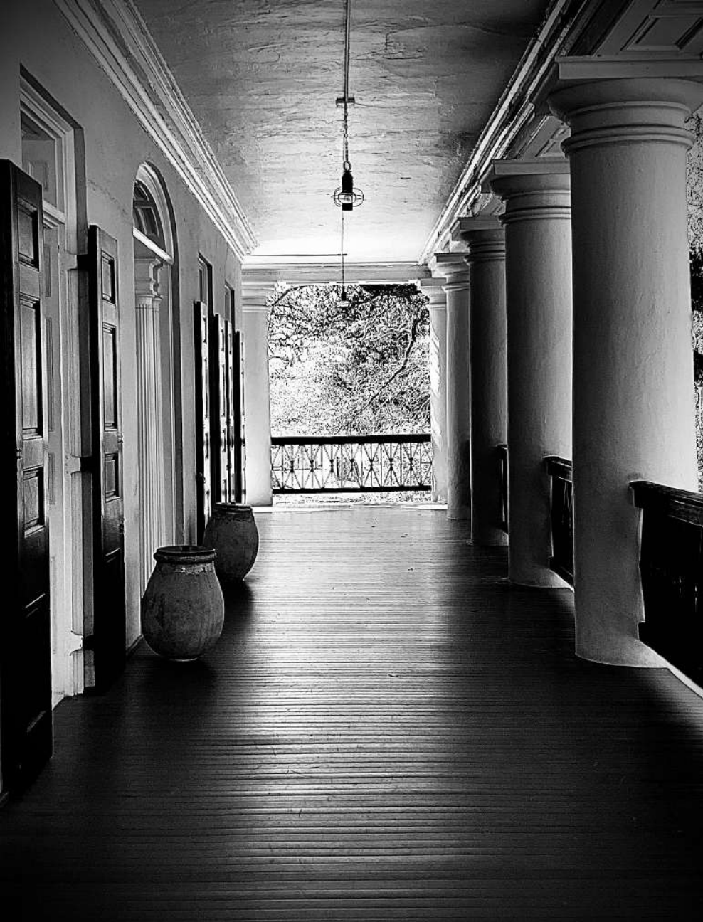
MATHEW FIWKA "A STEP IN TIME"