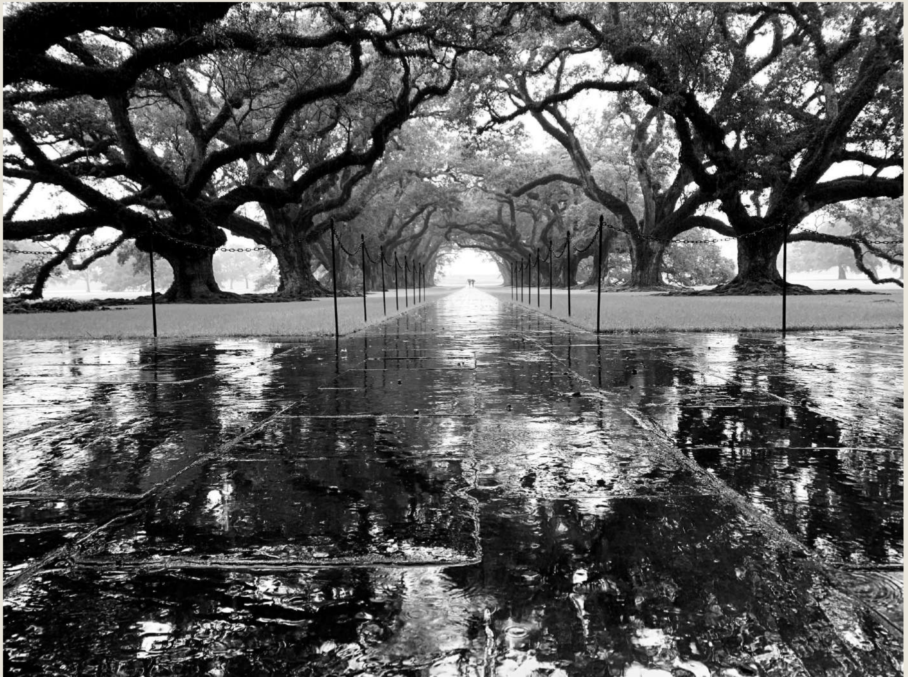
2ND PLACE - LANDSCAPE/NATURE GARRICK READ "REFLECTIONS OF NATURE"