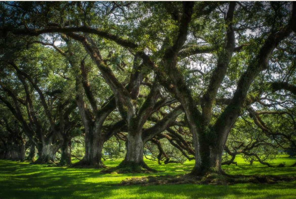
YUQING SUN "OAK ALLEY"