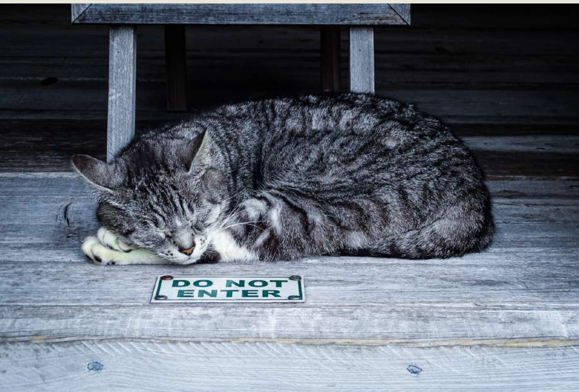
JULIA RAITHEL "BEWARE OF THE DOG"