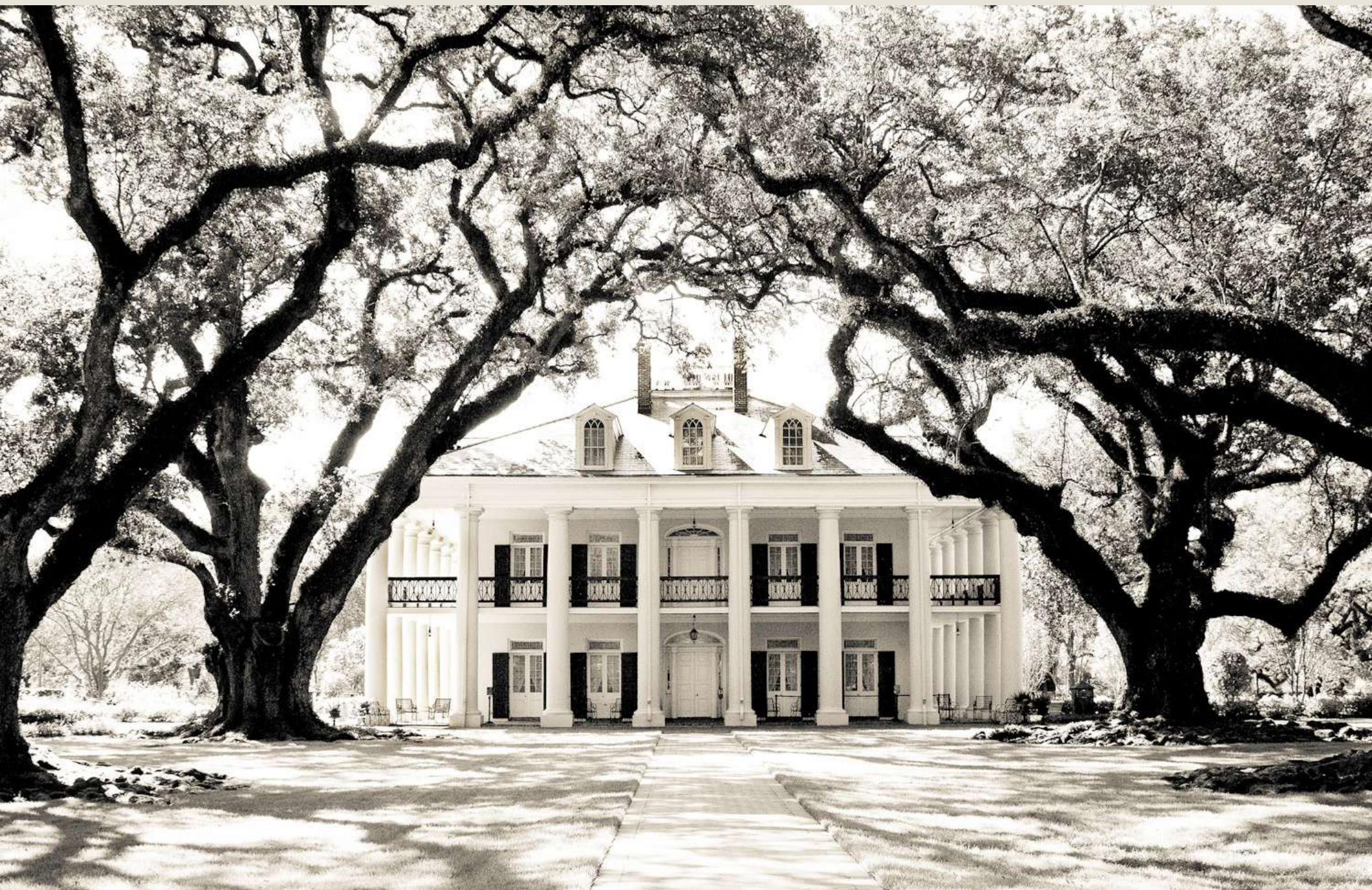
3RD PLACE - PHOTOGRAPHIC ART MICHELE NUNES "UNIQUE ALLEY"