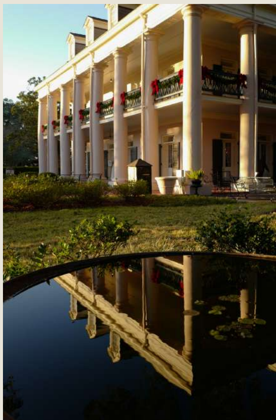
ELIZAVETA VAYNSHTEYN "POINT OF VIEW"