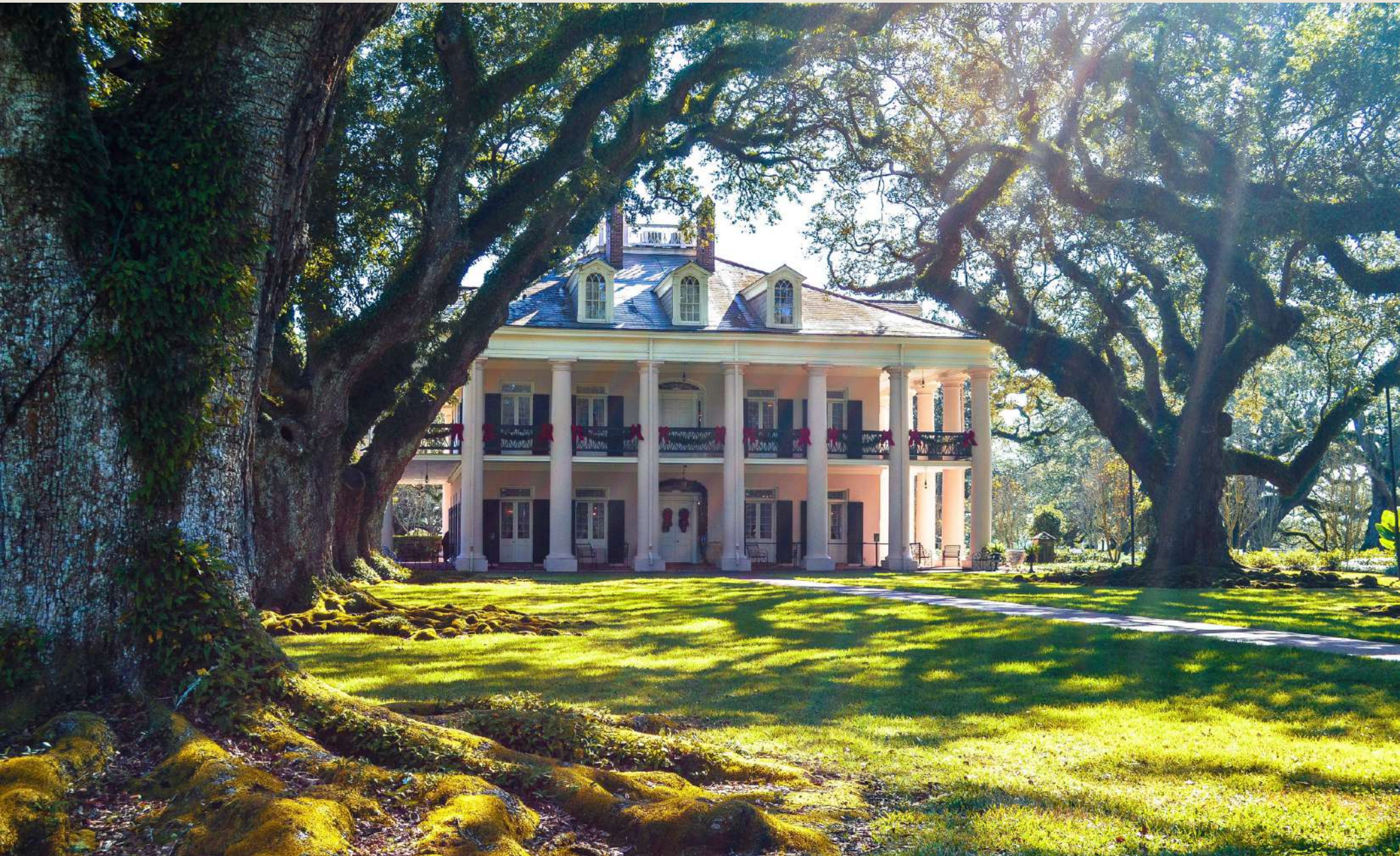
DUSTIN TORRES "SHROUDED IN OAKS"