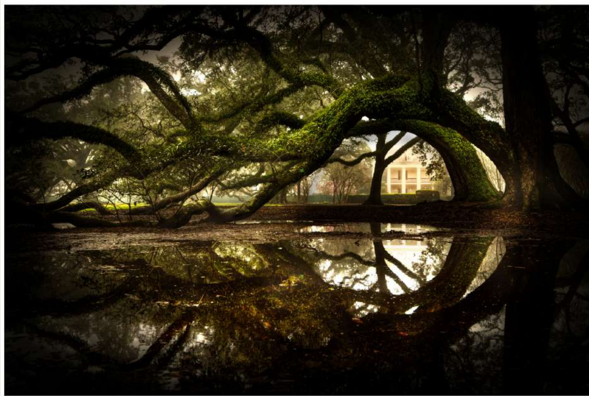
SUZI BROWN "REFLECTION"