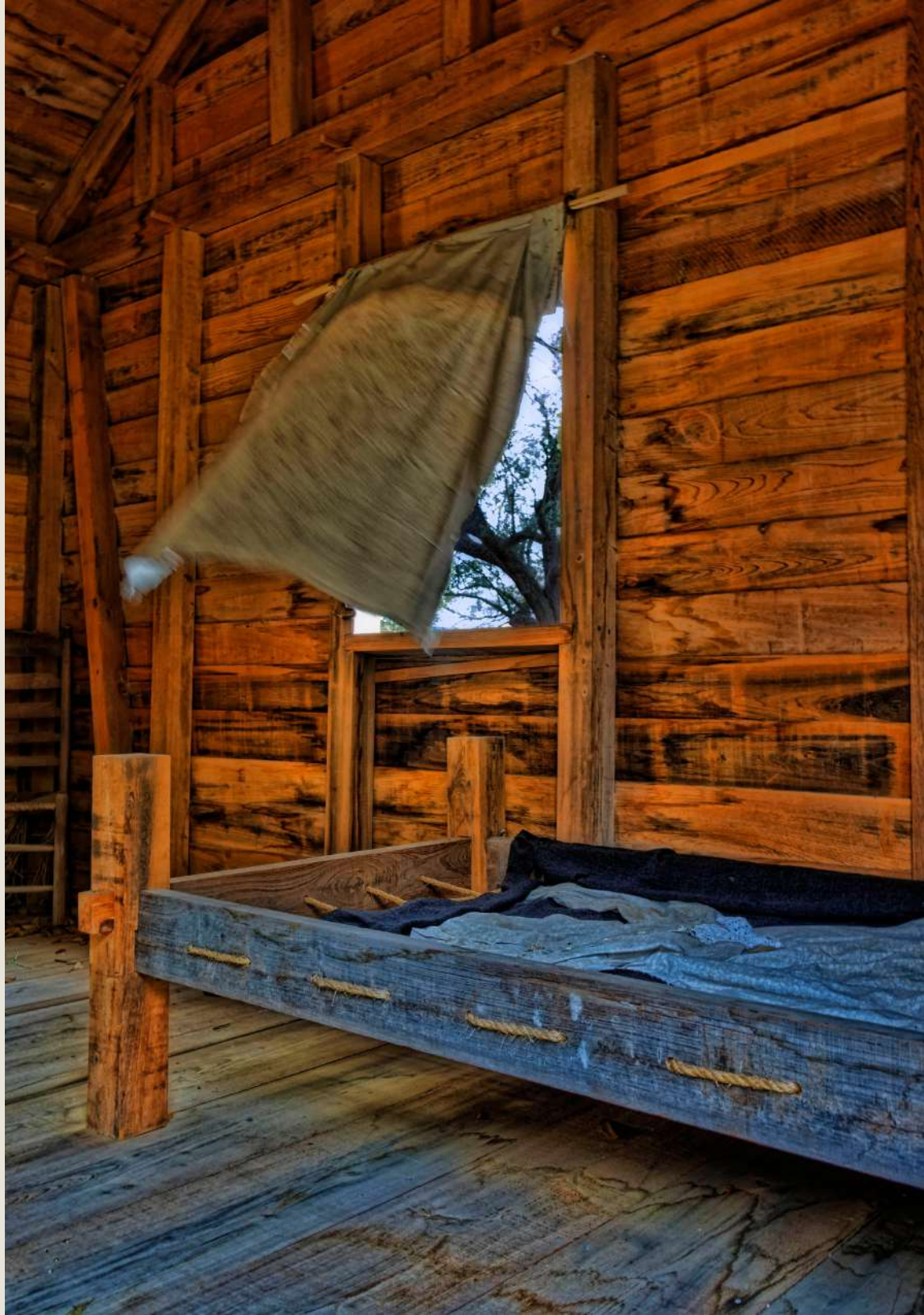
RUTH PLUCINSKI "SLAVE SPIRIT"