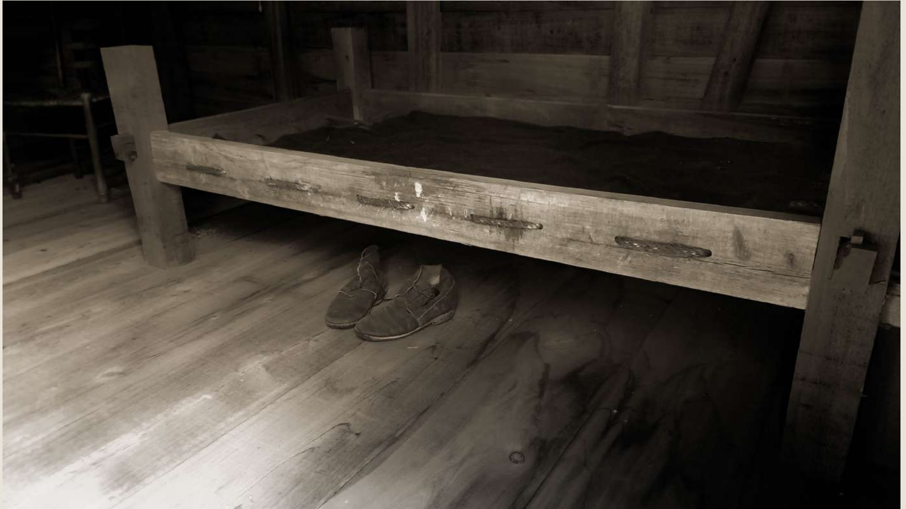
2ND PLACE - PHOTOGRAPHIC ART RODERIC HUDSON "COURAGE"