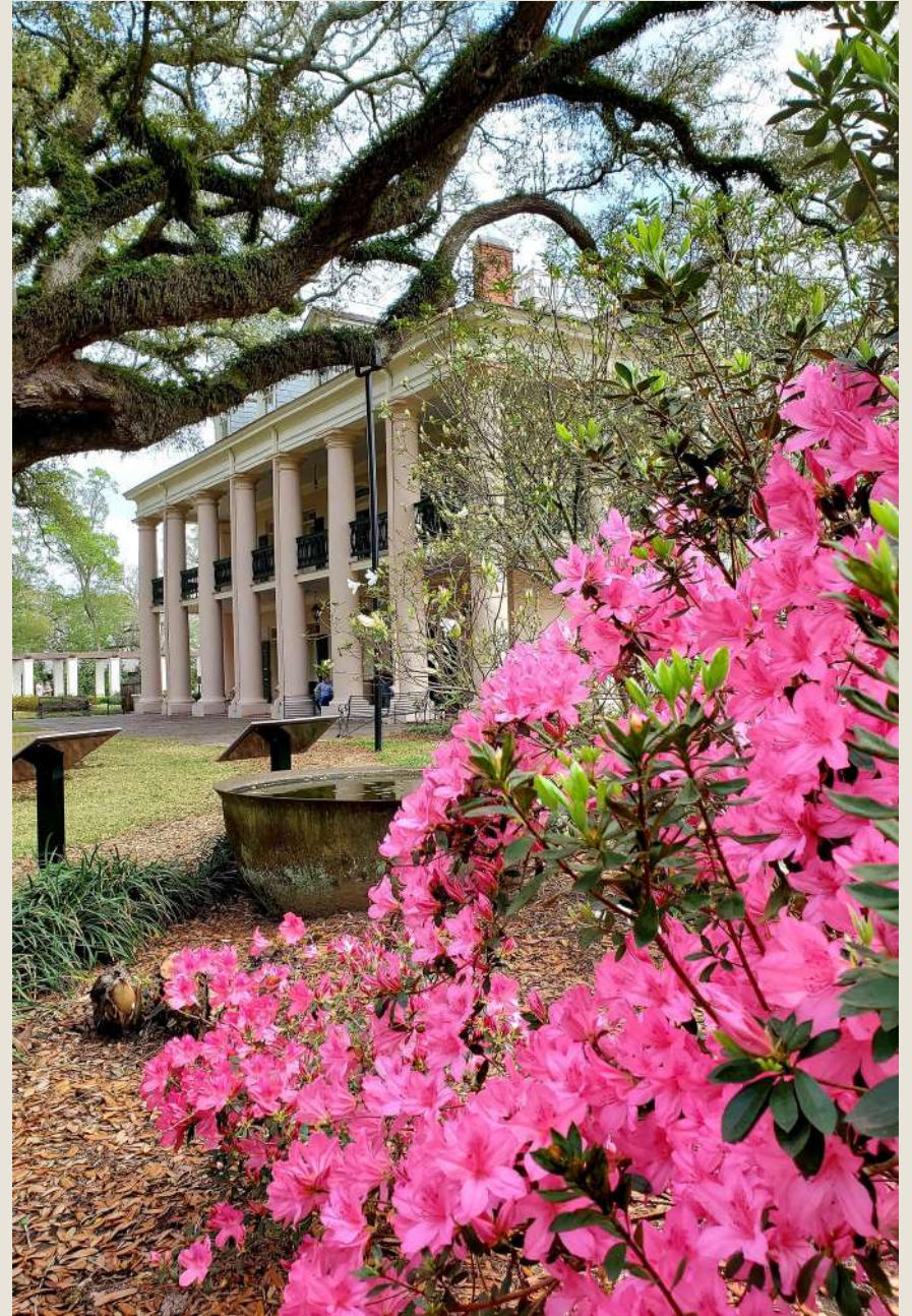
LEAH WELCH "AZALEA BLOOMS"