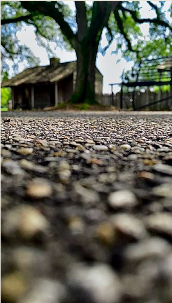
EMMALENA GLOVER "WHEN WE ARE GONE"