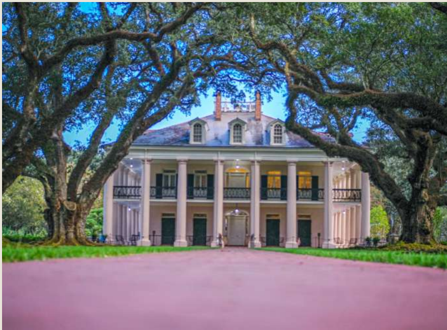
TIFFANY RAGEN DERRICK "BIG HOUSE"