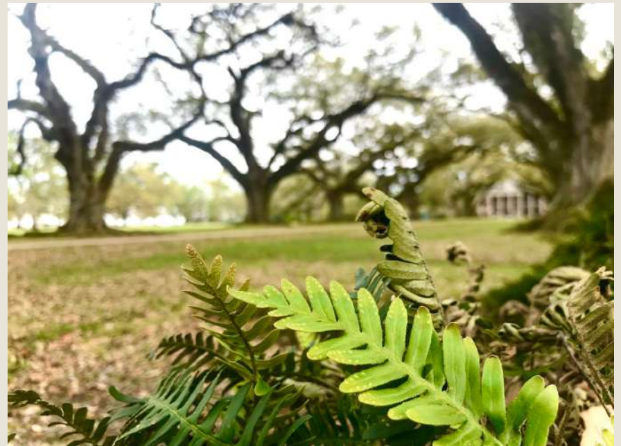
LU HE "BEGINNING OF GREEN"