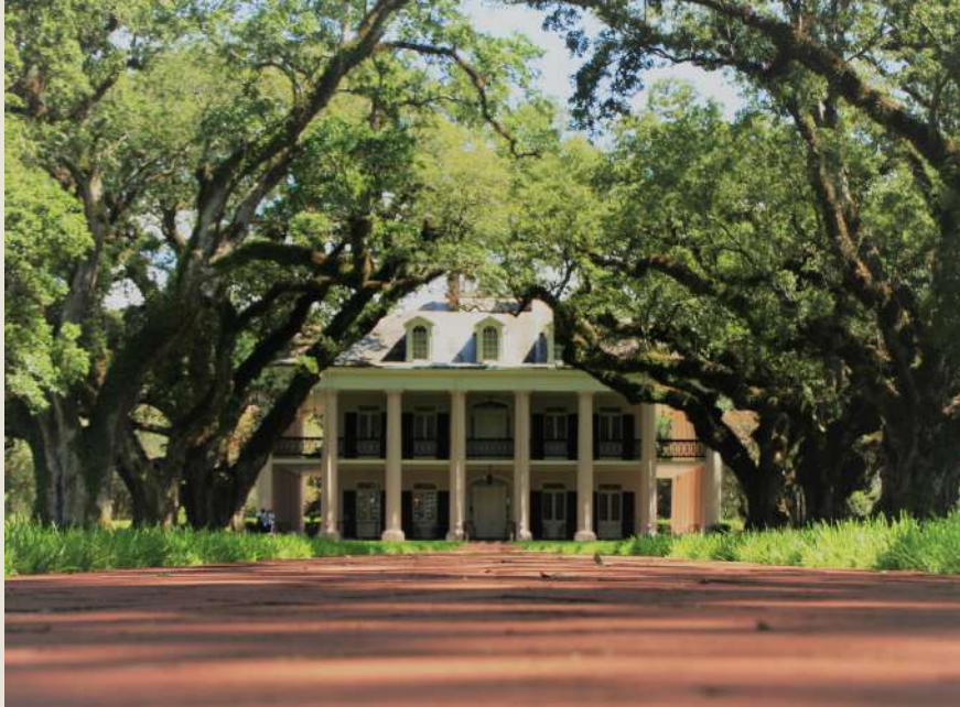
LACY ANN WELSH "A DREAM"