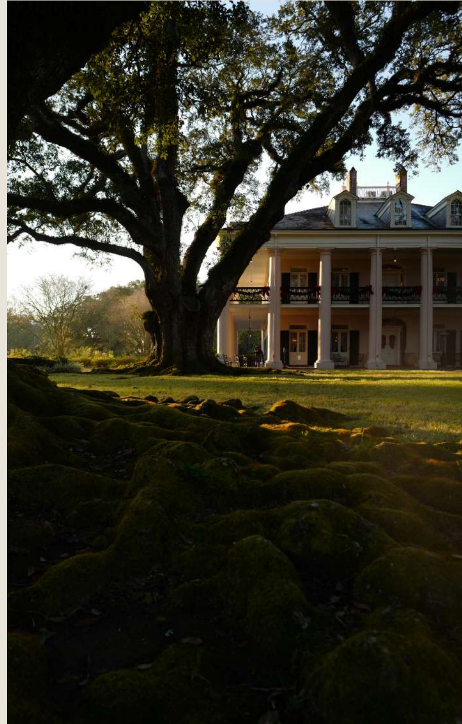
ELIZAVETA VAYNSHTEYN "WRINKLES OF WISDOM"