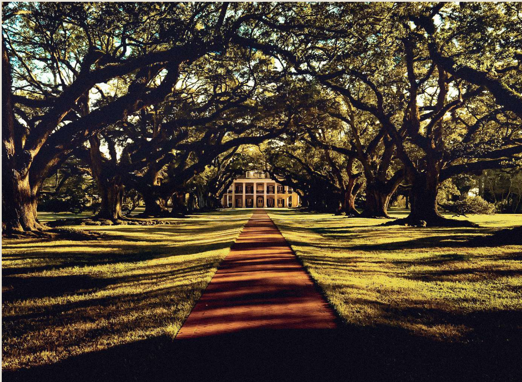
1ST PLACE - ARCHITECTURE TYLER COCHRAN "THE BIG HOUSE"