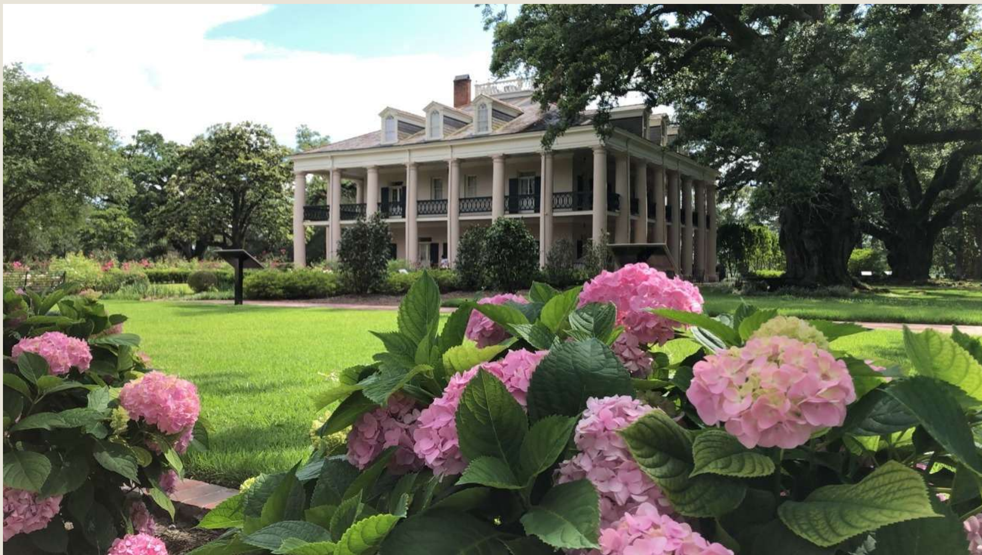
3RD PLACE - LANDSCAPE/NATURE RUBY DAVID "SPRINGTIME AT OAK ALLEY"