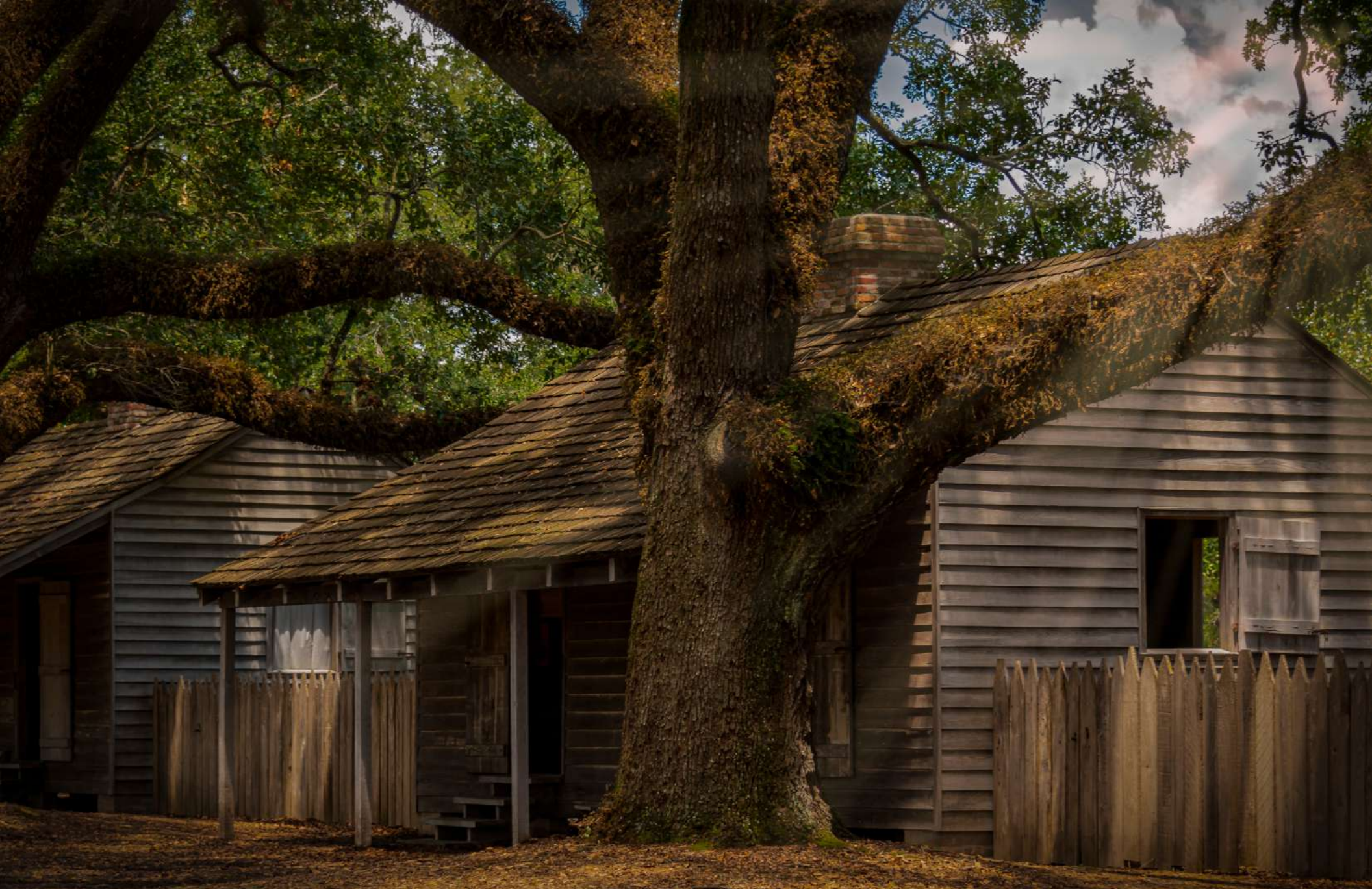
2ND PLACE - ARCHITECTURE LARRY D. CRAIN "CABIN UNDER SUNBEAM"