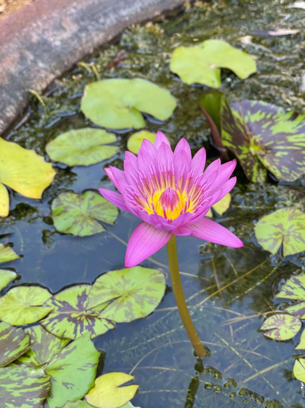
2ND PLACE - PORTRAIT/STILL LIFE CRYSTAL MCDANIEL "PRETTY IN PINK"