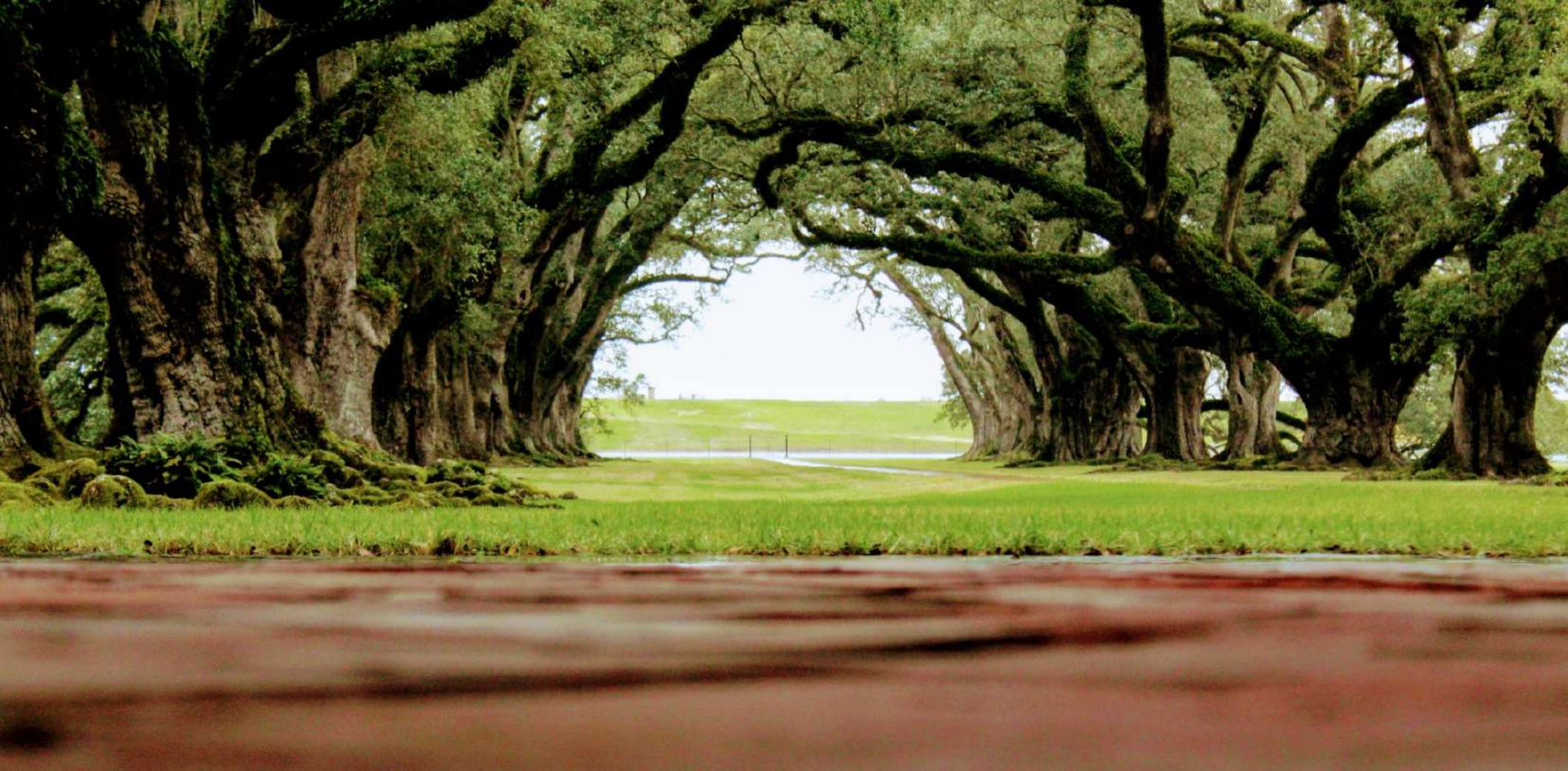
MELISSA VARGAS "PERSPECTIVE"