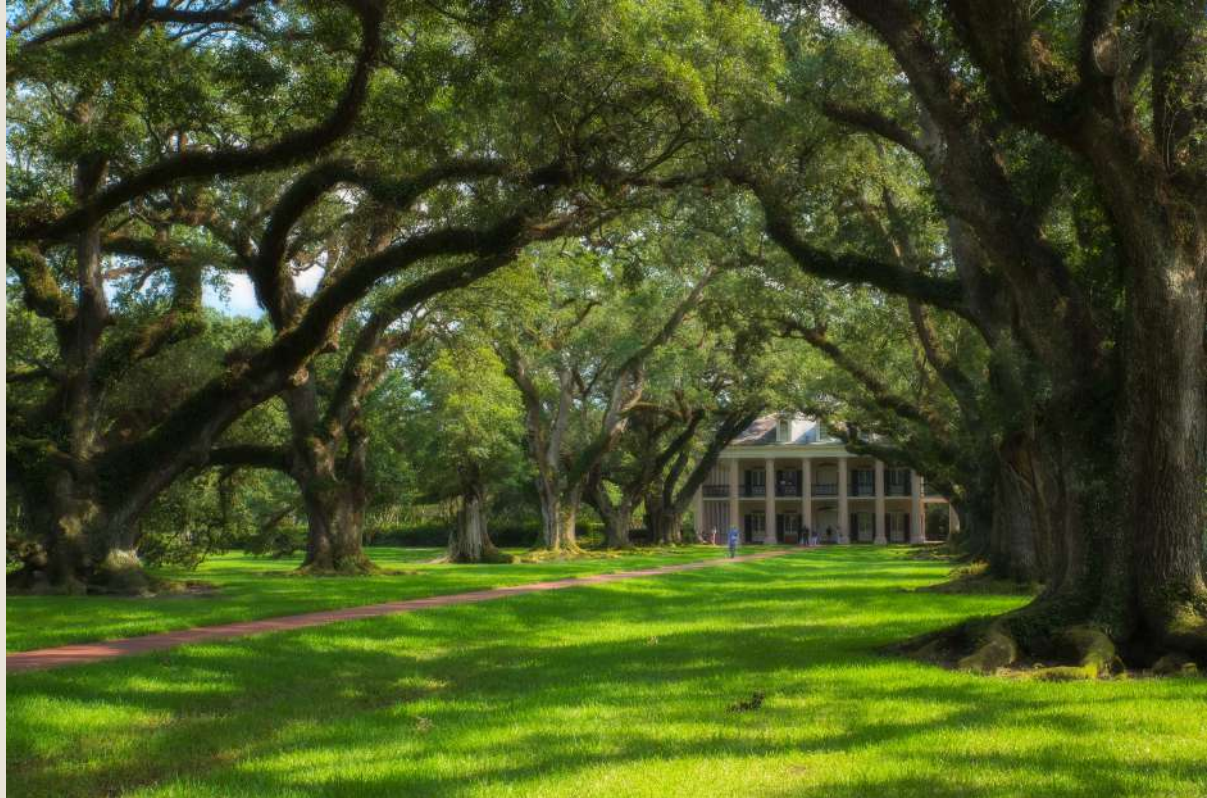
YUQING SUN "GREEN DREAM"