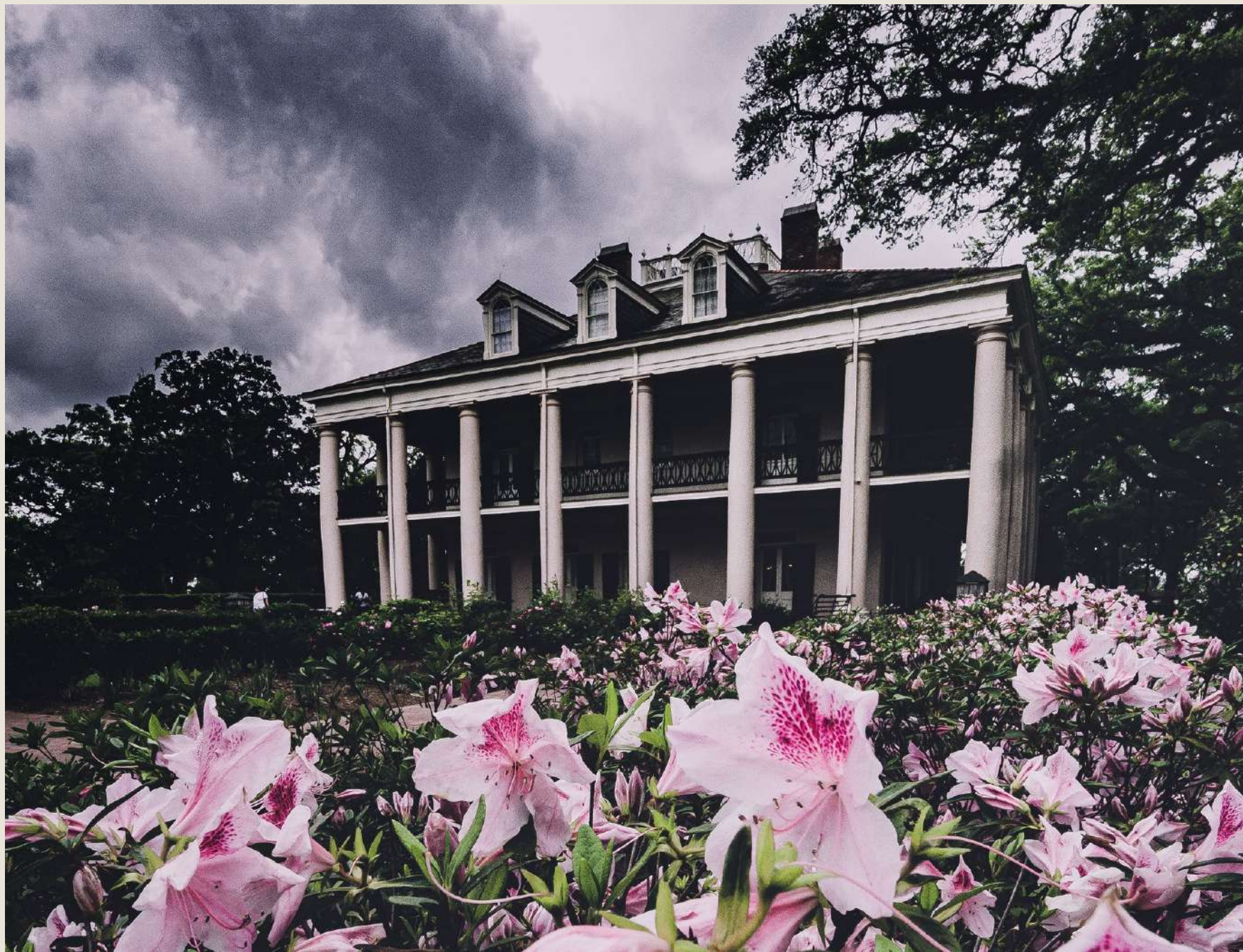
DANIEL LOUISA "BEAUTY AMONG THE STORM"