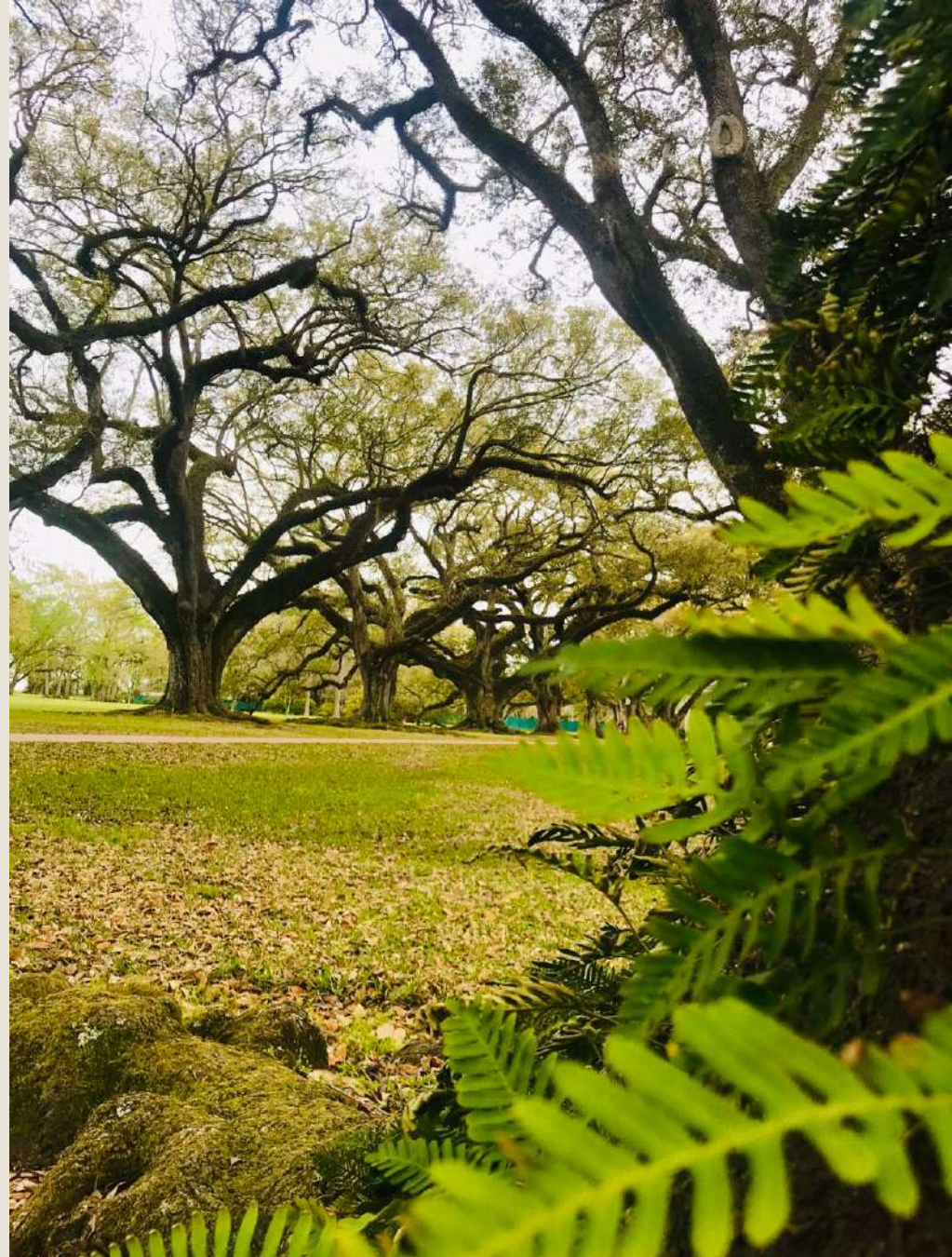
HAIFENG WANG "THE GREAT OAKS"