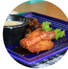
3 Steve's Steakhouse & Seafood 417 Crescent Ave. 310.510.0333 StevesSteakhouse.com