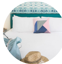
7 Bellanca Hotel 111 Crescent Ave. 310.510.0555 BellancaHotel.com