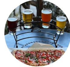
4 Catalina Island Brew House 417 Crescent Ave 310.339.8085 CatalinaBrewHouse.com