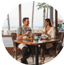
6 Avalon Grille 423 Crescent Ave. 310.510.7494 VisitCatalinaIsland.com