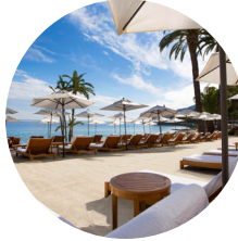
2 Descanso Beach Club 1 St Catherine Way 310.510.7410 VisitCatalinaIsland.com