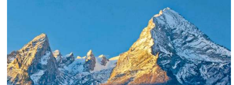
Don't miss the Berchtesgaden National Park & Salzburg! Choose 2 of 4 possibilities