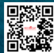
Scan QR code for current prices

Tour is suitable for six years & over. Children under six years old must be approved before departure and supply own lifejacket. We reserve the right to alter snorkelling locations due to tidal location changes, safety concerns or weather conditions. All-inclusive: Lunch with morning and afternoon snacks, Lycra suit, snorkelling equipment, parks fees and fuel levy.