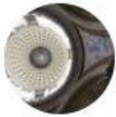
JC25DES Denver, Colorado