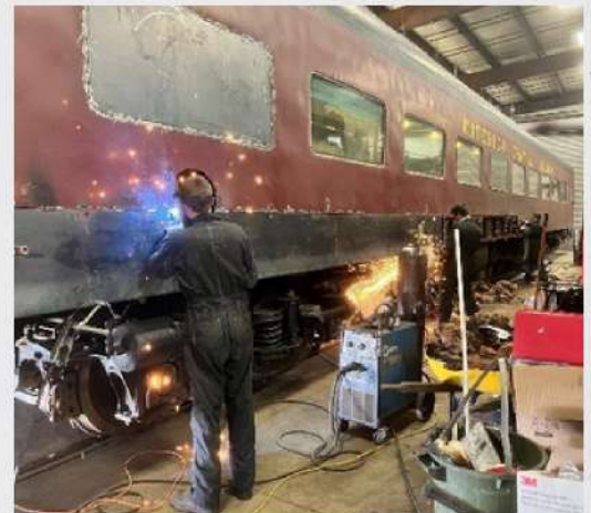
Above: Ted removing old insulation. Above Right: Spruce Crest Welding assisting.