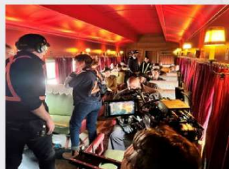
Above Right: Murdoch Mysteries recent shoot, S17 E13 "Train to Nowhere" available to watch on YouTube.