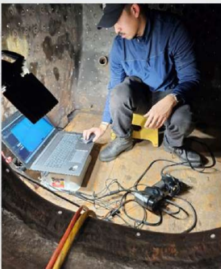
Digital scanning to the computer

New technology is being used to design and build, we are leading in this area. Five years ago a new innovative exhaust system designed in Europe was constructed by WCR this will assist in reduced coal and water consumption and lessen emissions. This is the first locomotive in North America to have this design in use.