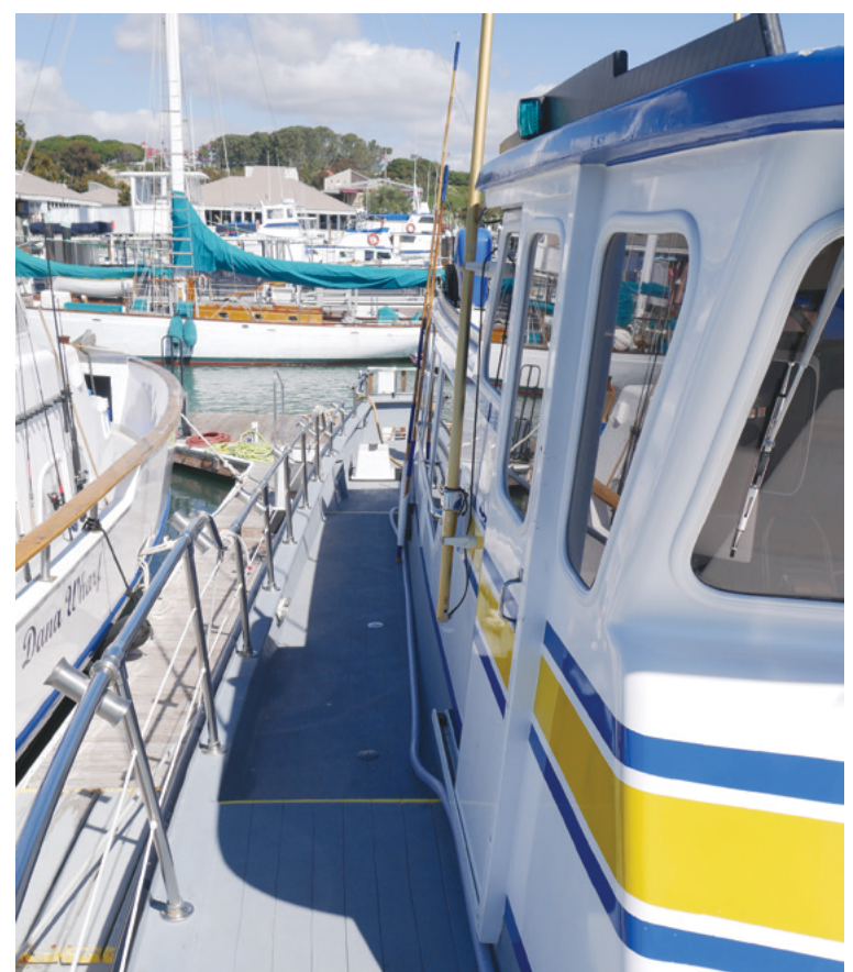
MOVING FROM BOW TO STERN is a piece of cake on the New San Mateo, especially since she's typically only going to have a dozen anglers on deck.