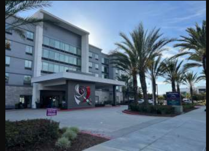
Shuttle Service to and from the facility each day for training