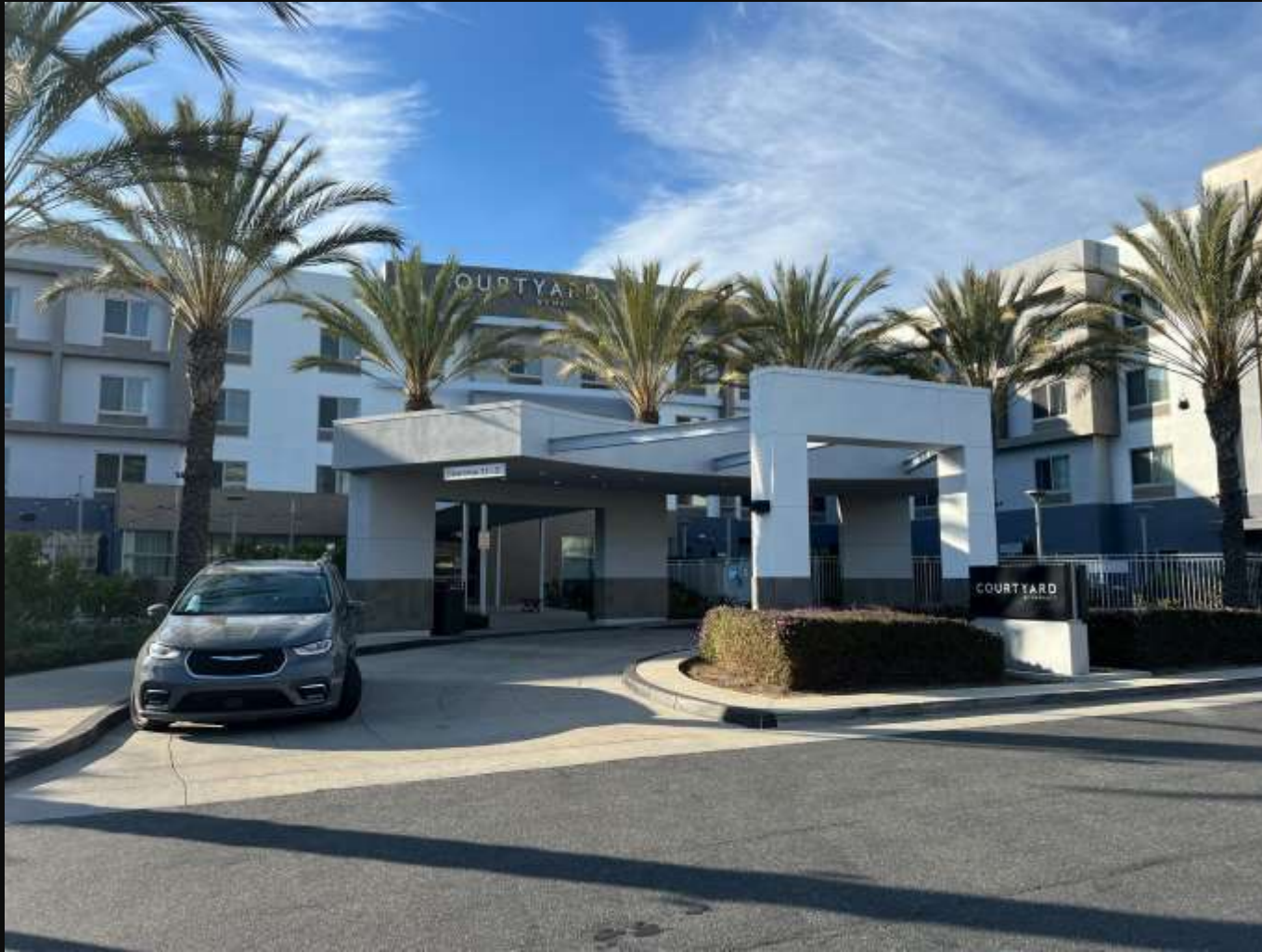
High-quality local hotels at Long Beach Airport