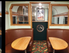
Effie Dean Tavern Lounge

The rebuild of the Mark Twain Zephyr was once thought to be beyond reach, we are proud to give future generations the opportunity to experience this great train. Guests will experience history in the onboard theater and Zephyr Display Car, and learn how this train helped usher in the future of passenger trains during the Great Depression. This train is certainly something to look forward to!