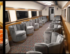
Tom Sawyer Parlor Section