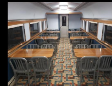
Huckleberry Finn Dining Car