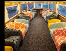
Tom Sawyer Observation Lounge

The only Shovelnose Streamliner you can ride!