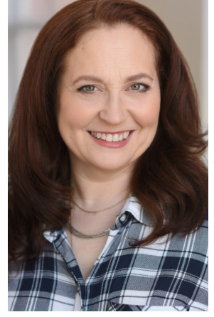
BETTINA SKYE Actor