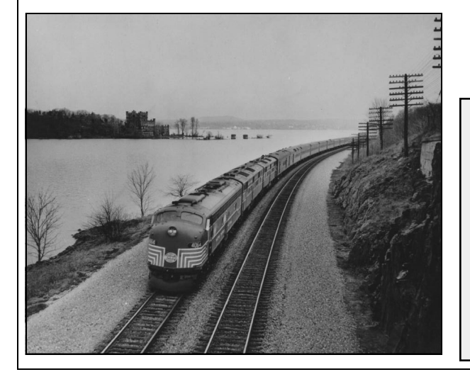
2. The New York Central passes Bannerman Island in the early 1960's.