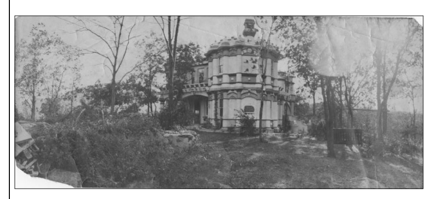
1. The Bannerman Island Family Residence