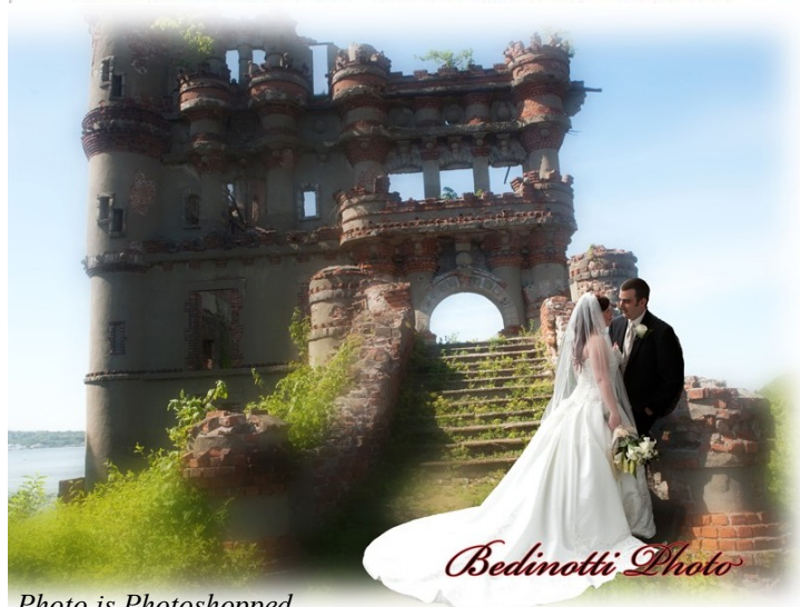
Photo is Photoshopped

onboard The Bannerman Castle Trust's new vessel, The Estuary Steward . Your Bannerman Island adventure begins at the Newburgh or Beacon waterfront every Saturday and Sunday, May through October. The Estuary Steward departs at 11:00 a.m. from Torches Dock in Newburgh and from the Beacon Ferry Dock in Beacon at 12:30 p.m. Book your Bannerman Island walking tour directly online by going to www.bannermancastle.org