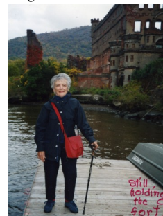
Left: On Bannerman Island, 2004