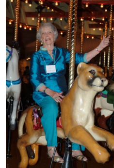
Left: Bear Mt. Carousel