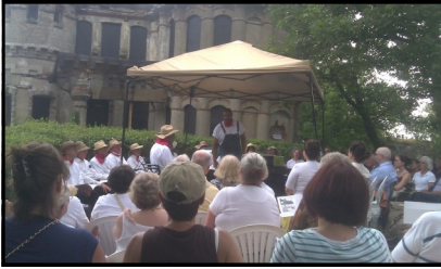
Show Boat played to sold out audiences on July 7 and 8.