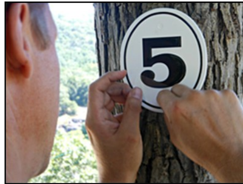
Roger A. DeVries of Far View Contracting created trail markers (pictured above) to aid visitors on the island during our new self-guided tours. These tours allow visitors to bring their own picnic lunch, enjoy a little music, and see the island at their own pace.