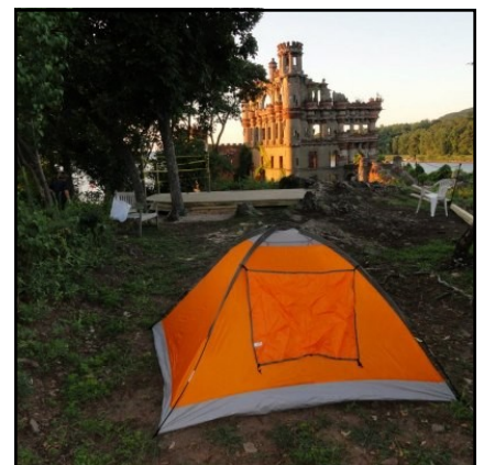
Hudson Valley Outfitters sponsored two overnight kayak fundraising tours in August and September. Contact HVO for 2013 campouts.