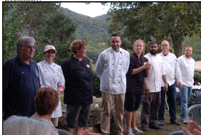
Hudson Valley Chefs Consortium sponsored the Third Annual Bannerman Farm Fresh Chefs Dinner on September 9th. Rain postponed the event which was originally to have been September 8th.