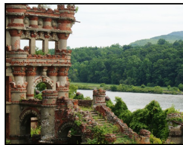
Bannerman Main Structure Walls (above) to be stabilized through this project.

While our plans for stabilization moved forward, we reached out to Choice Words to help us to identify funding sources worth pursuing and to assist the Trust with grant proposal preparation. Our efforts were rewarded when the Trust received the following grants for stabilization in 2012: J.M. Kaplan Foundation—$25,000, National Trust for Historic Preservation—$5,000, The Jane Nuhn Charitable Trust—$20,000 in 2012 and $20,000 in 2013. Additional grants included: The Dyson Foundation for a new Strategic Plan prepared by Fairweather Consultants—$10,000, Chase Community Giving—$10,000, which are positioning us to fund the construction. The EPF Grant requires that we pay 100% of the construction costs up front, and then apply for 50% reimbursement. For the residence project, we were