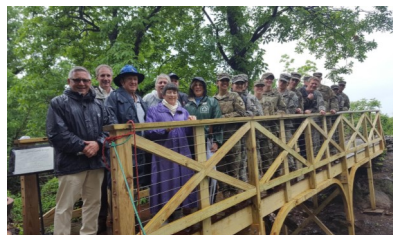
Grand Opening of the West Point Bridge