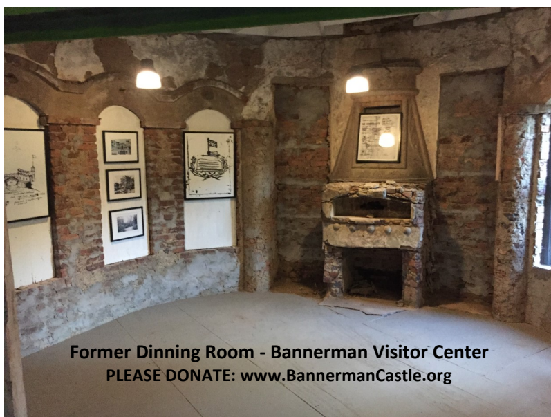
Former Dining Room - Bannerman Visitor Center