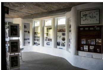
Residence restored sun porch

2017 COMPLETED PROJECTS — In 2017 The Bannerman Castle Trust completed several major projects, that could not have been completed without the support of our friends. We spent over $186,000 on building the new Bannerman Island West Point Bridge, restoration of North Trail and renovating and preserving the Bannerman Residence as a Visitor Education Center.