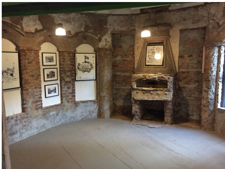
The Dining Room in the Bannerman residence after preservation. The Bannerman Residence Visitor Center. Circa 2017