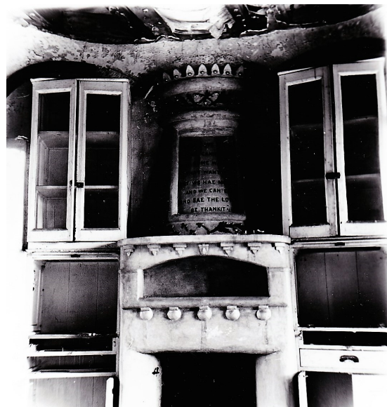
The Dining Room— Circa 1950's