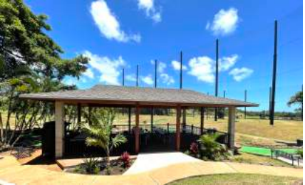
Town Deck - 50 people max/$200 for 3 hours