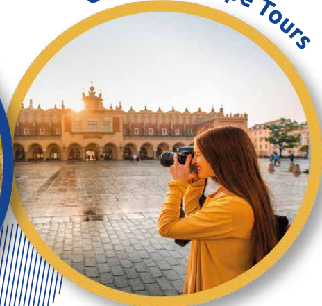
Central Europe Tours