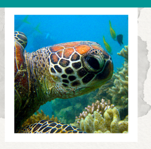
Meet new friends Above and below the water