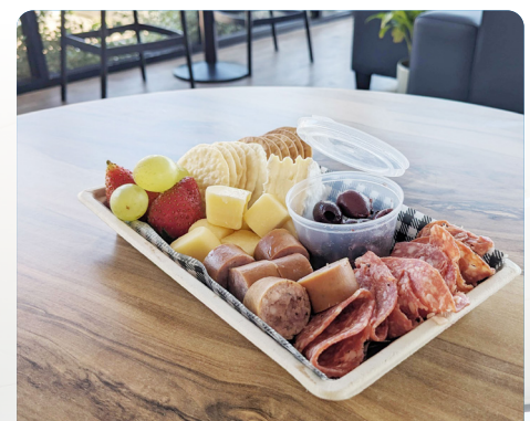
Mini platters for single serve