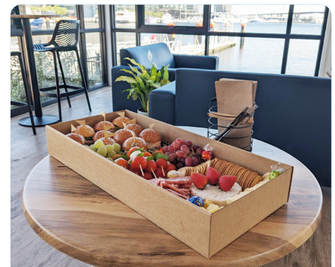
Larger platters for cocktail style