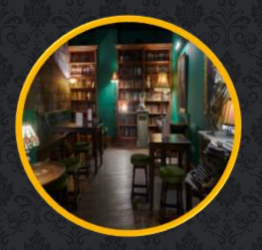
THE LIBRARY £90 per hour Groups of up to 20 people