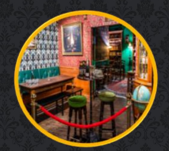
£150 per hour Groups of up to 50 people