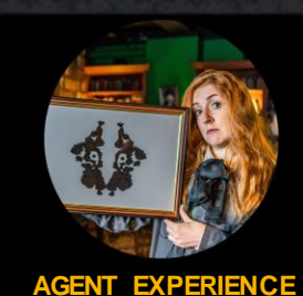
6+ People | £60 per person