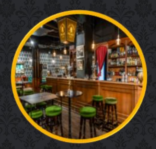
THE MIND PALACE BAR £300 per hour Groups of up to 150 people