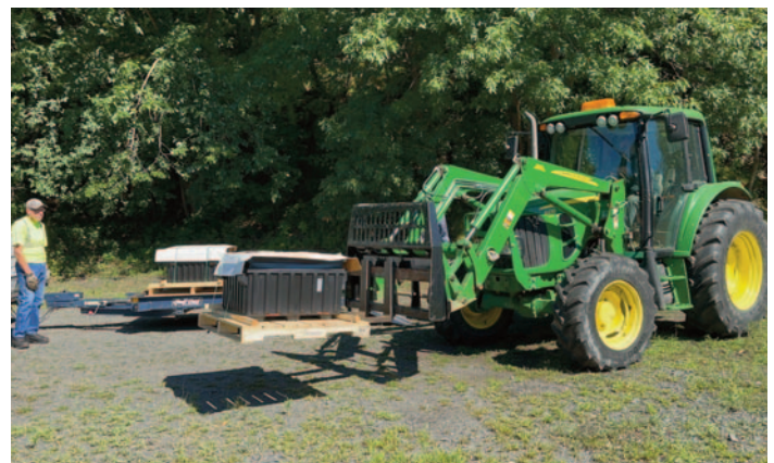
Tom moves a new battery from the trailer.

With the battery compartments opened and the leads disconnected, the delicate task of removing the 1,300-pound batteries began. Tom operated the tractor while Pete provided lifting direction via hand signals. With only a few inches of clearance between the battery and the compartment, there was little room for error.