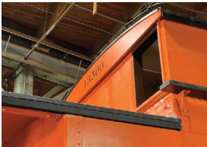
The front cupola has new fascia board. New window frame is underway in the wood shop.