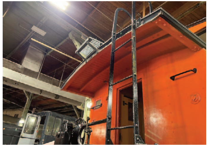
The back end with the old fascia board for comparison.