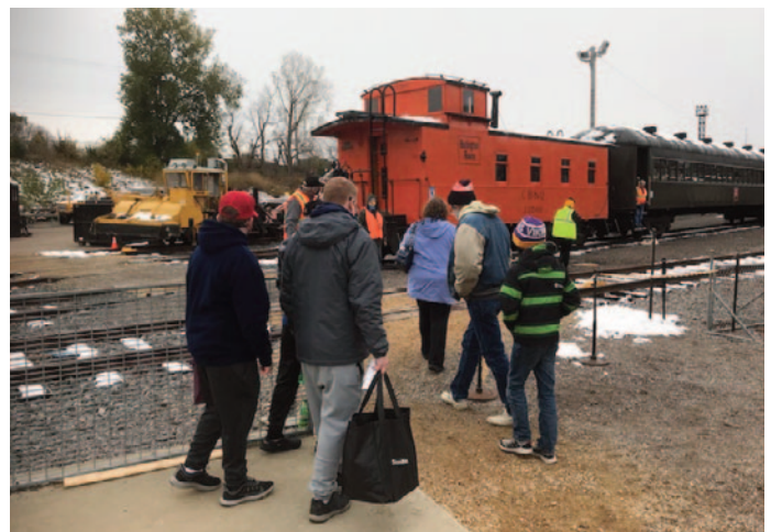
The CB&Q 13500 is a workhorse of the MTM caboose rides. The interior has bench seating for passenger comfort.