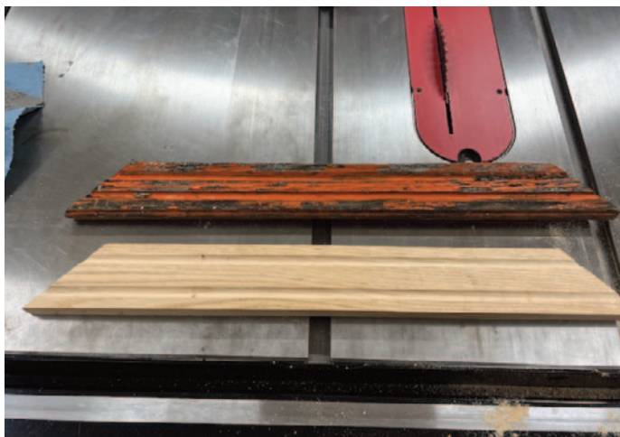
A comparison of the weather beaten window frame and new milled stock for replacement.