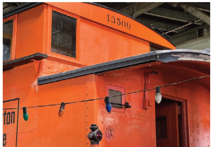
The rear cupola has new fascia board as well.