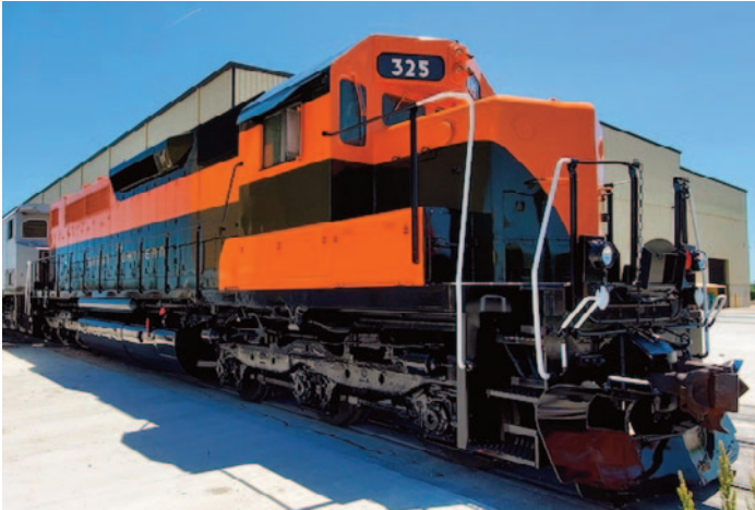
Freshly painted GN 325 at the Relco facility in Albia, Iowa.

Next month we will provide an update of other restoration projects underway at Jackson Street. Thank you to the donors who are making most of these restorations possible!