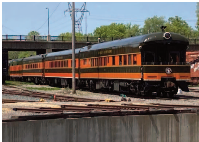
The gorgeously refreshed migration train begins its trek back to Osceola for the operating season.