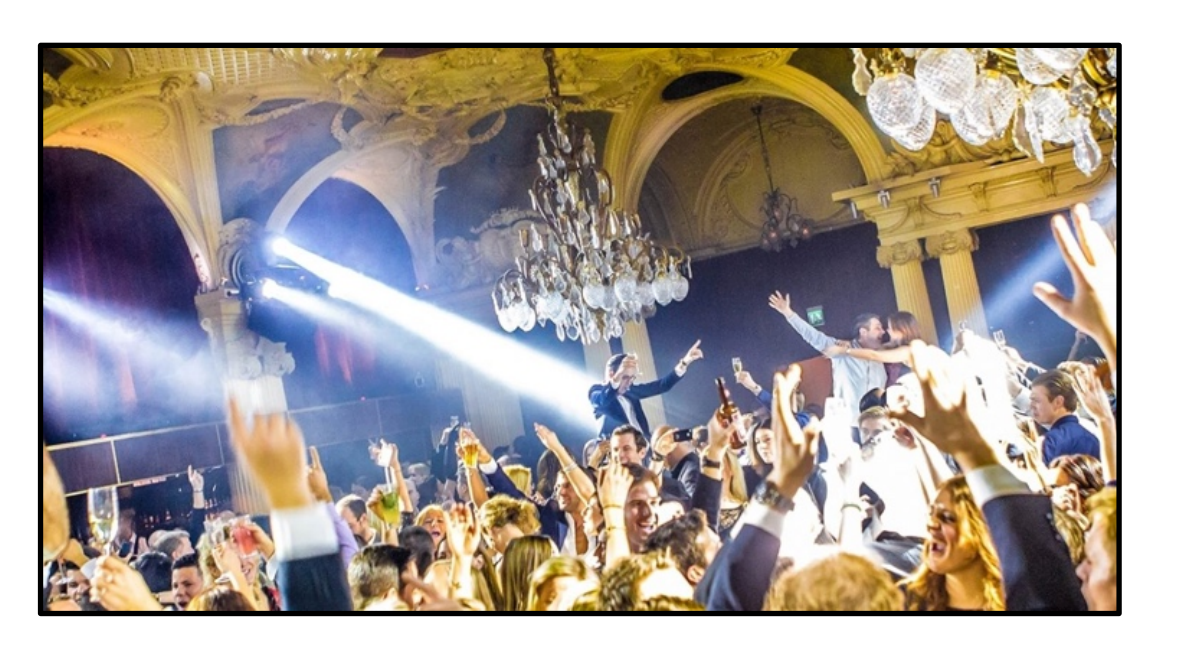
<u>Fashionable Nighclub and Restaurant</u> <u>Karl XXII's Torg, Norrmalm</u> <a href="https://www.cafeopera.se">https://www.cafeopera.se</a>

Located at the waterfront end of Kungsträdgården this trendy meeting place has awesome 19th-century decor, including lavish chandeliers and painted ceilings. Alongside dining and drinking, dancing is the main event here!