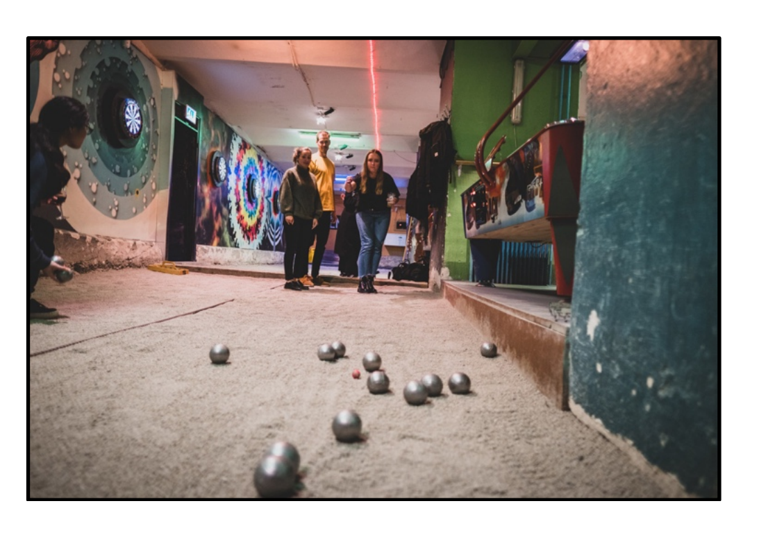
Underground boulebar, pub and board games Närkesgatan 6, Södermalm https://ugglanboulebar.se

If you want a fun evening of playing games, then Ugglan is a great place to go and have some fun! They have Boule lanes, shuffleboard and a stack of board games so that you can have maximum fun whilst supping your favourite tipple.