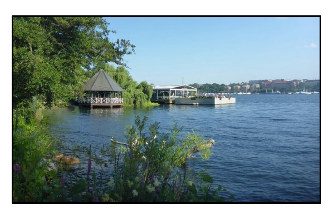
A gorgeous spot in the city for lunch, dinner and drinks

Norr Mälarastrand 64 Kungsholmen https://ny.malarpaviljongen.se