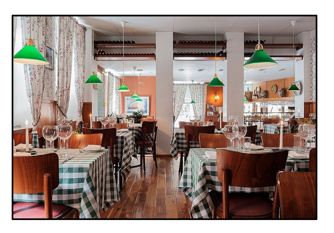
<u>Delicious traditional Swedish food</u> <u>Stora Nygatan 24, Gamla Stan</u> <u>http://www.slingerbulten.com/contact</u>

Another cozy dining room, this one located in the heart of Gamla Stan. They also offer delicious traditional Swedish classics, alongside a relaxed atmosphere, good service and reasonable prices!