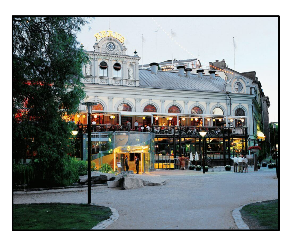
<u>Historic Hotel, Restaurant and Bars</u> <u>Näckströmsgatan 8, Berzelli Park</u> <u>https://berns.se</u>

Beautiful landmark building dating from 1863 located in Berzelli park, right in the city centre. They have a stunning Asian restaurant, Stockholm's first in the 1940's, and several fantastic bars. Nightlife is great here, offering live music and dj's most weekends.