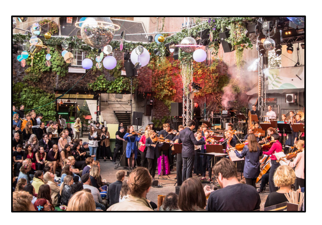
Open air night club with a festival vibe Hammarby Slussväg 2, Södermalm https://www.tradgarden.com

Located under the Skanstull bridge, this hugely popular open-air club creates a festival atmosphere with multiple entertainment spaces during the summer (May - September). In the colder months, the action moves indoors to the two-story nightclub Under Bron.