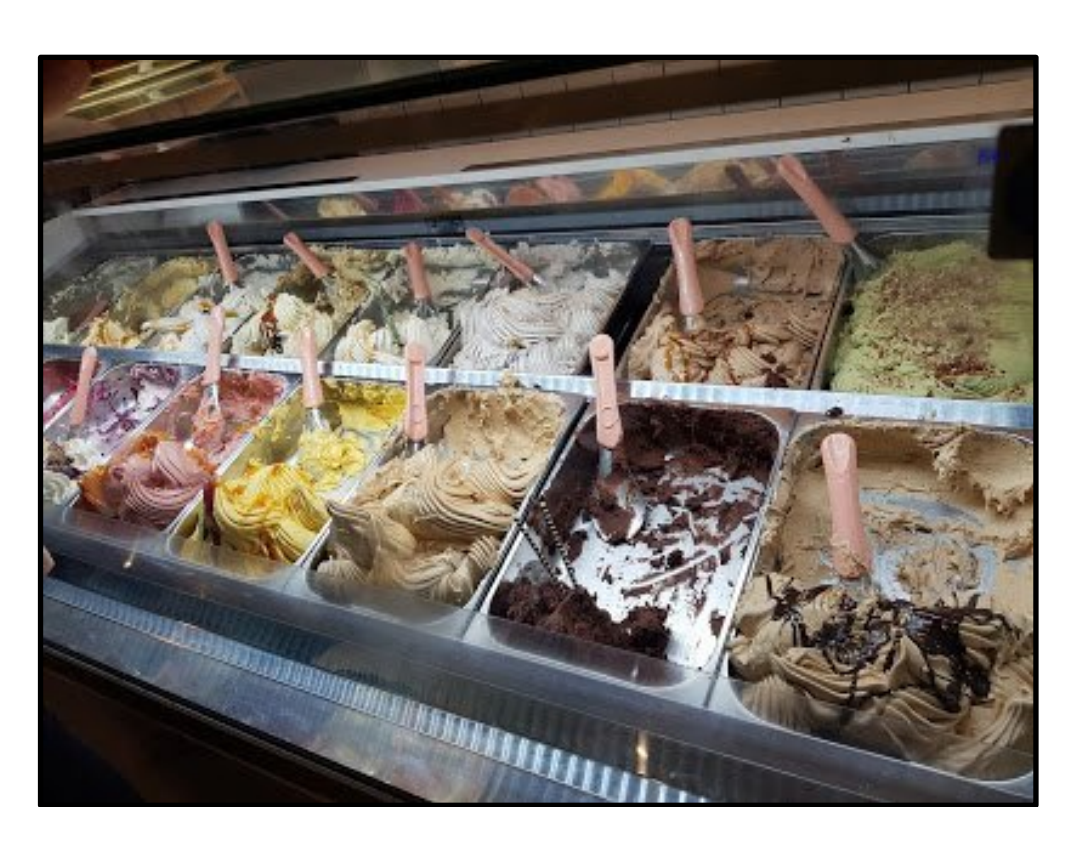
Exceptional handmade gelato Södermalm, Vasaparken, Nacka, Täby https://snogelateria.se/

Snö has been awarded for their delicious handmade gelato, so why not stop by to try some of their creatives flavour combinations.