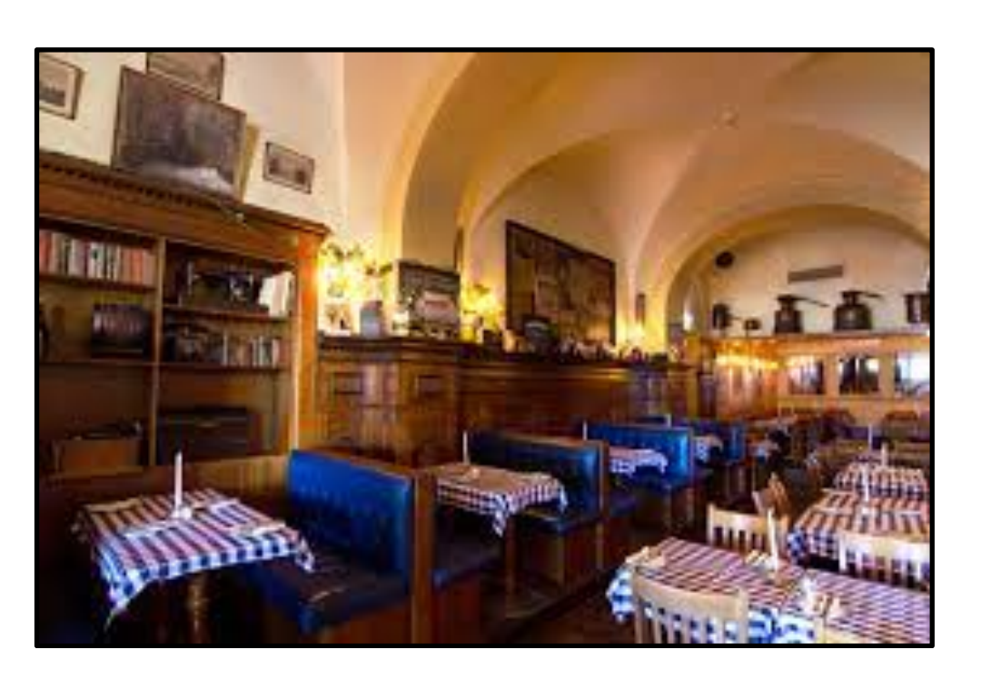
Delicious traditional Swedish food Södermalmstorg 6, Slussen http://bla-dorren.se/

This cozy beer hall and dining room is conveniently located by Slussen. They offer traditional Swedish classics, alongside a relaxed atmosphere, friendly service, and reasonable prices!