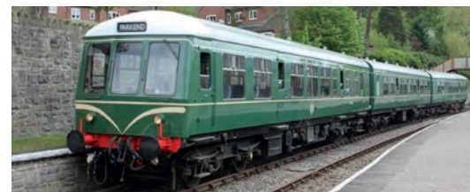
DMBS E50619: Power Car with Guards Compartment

Our Group, since its inception in 1992, has grown from owning and operating a 2-car set of Class 108 DMUs to a 5-car set – think what else we could achieve with your help.