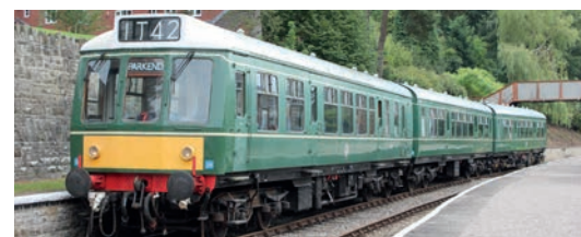
DMBS M51914: Power Car with Guards Compartment