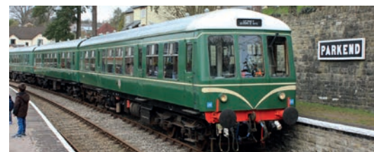
DMCL M51566: Power Car