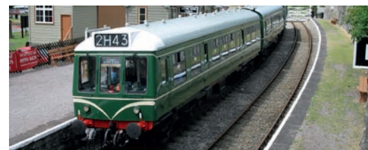
DTCL M56492: Driving Trailer