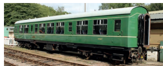
TSL E59387: Centre Trailer