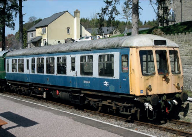
M51566 as she was when she arrived at DFR

We have subsequently purchased two more power cars and a centre trailer car, the only one built to this design in existence, giving us a fleet of five vehicles to operate on the DFR.