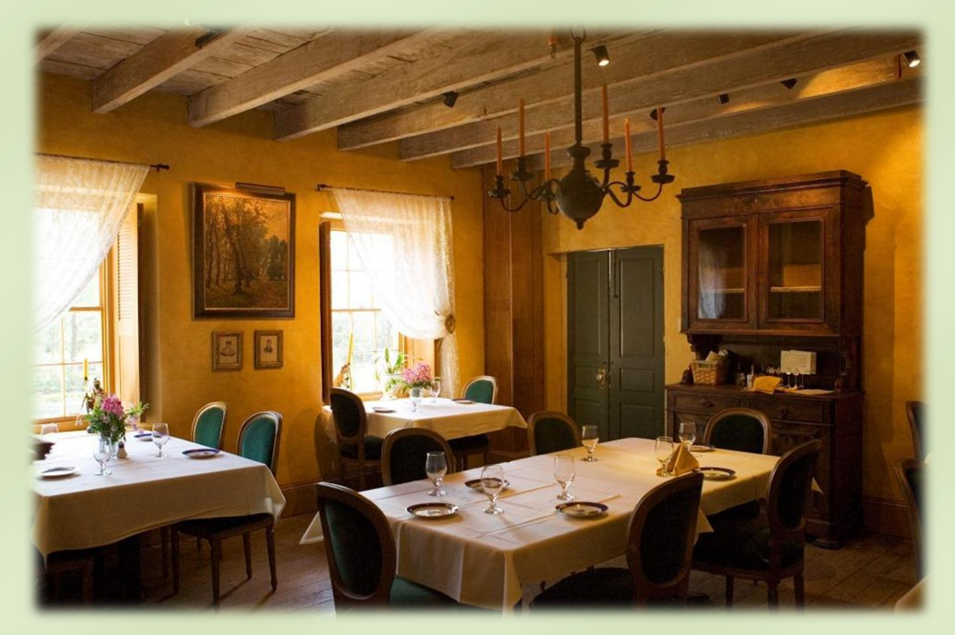
The Yellow Room