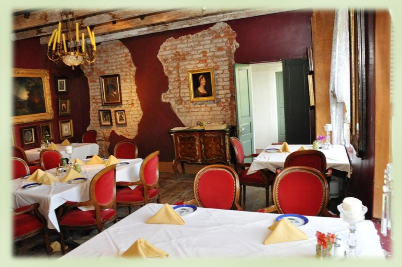
The Red Room