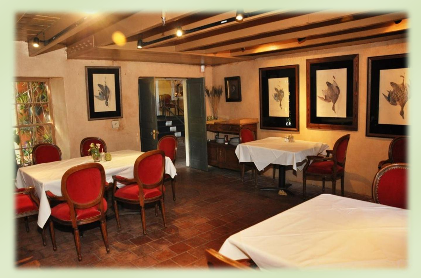
The Hunter's Room