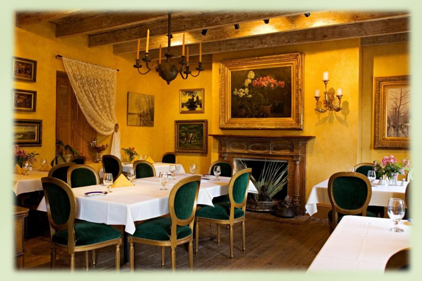
The Yellow Room