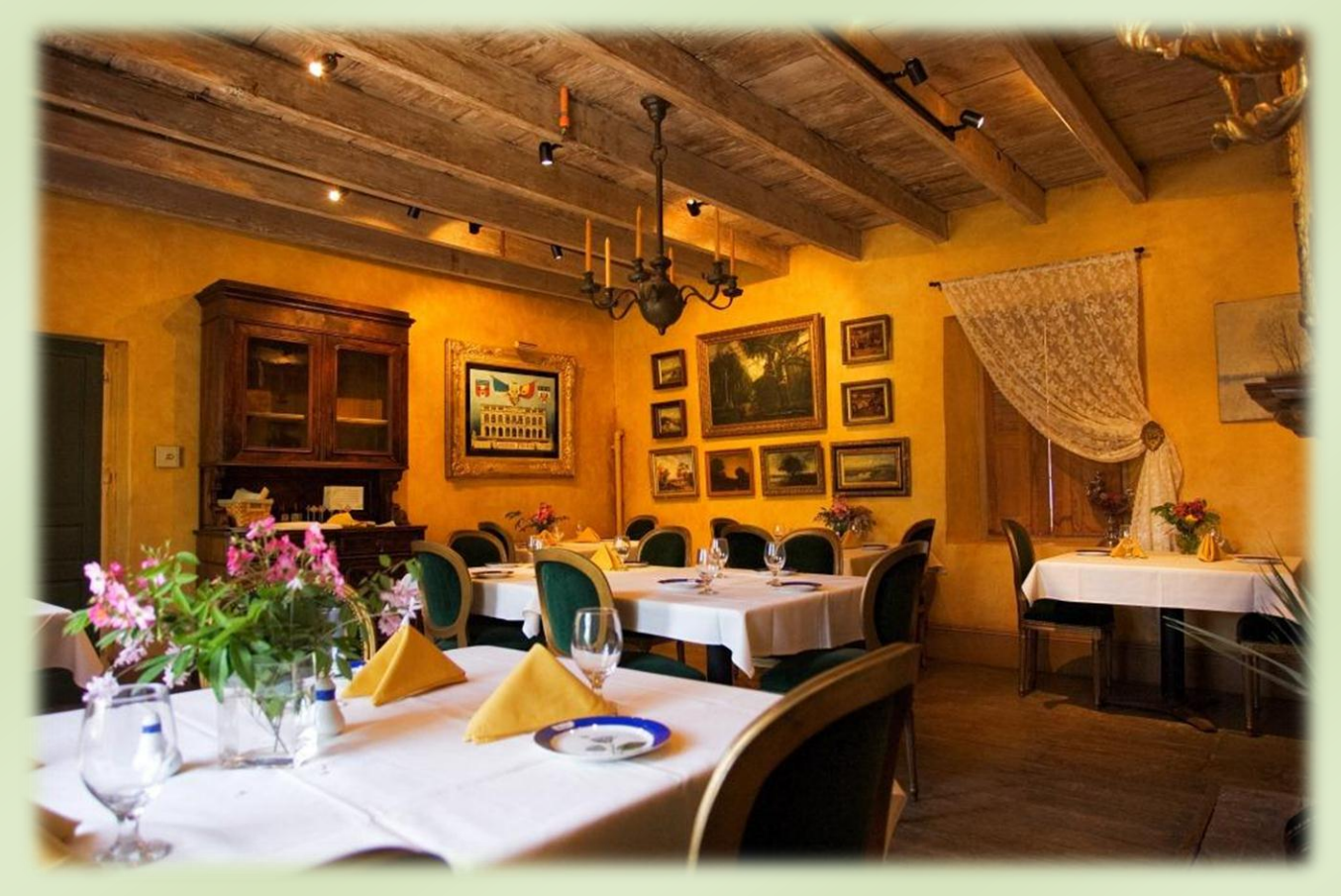
For smaller or more intimate gatherings, we offer our fine dining restaurant, Latil's Landing.