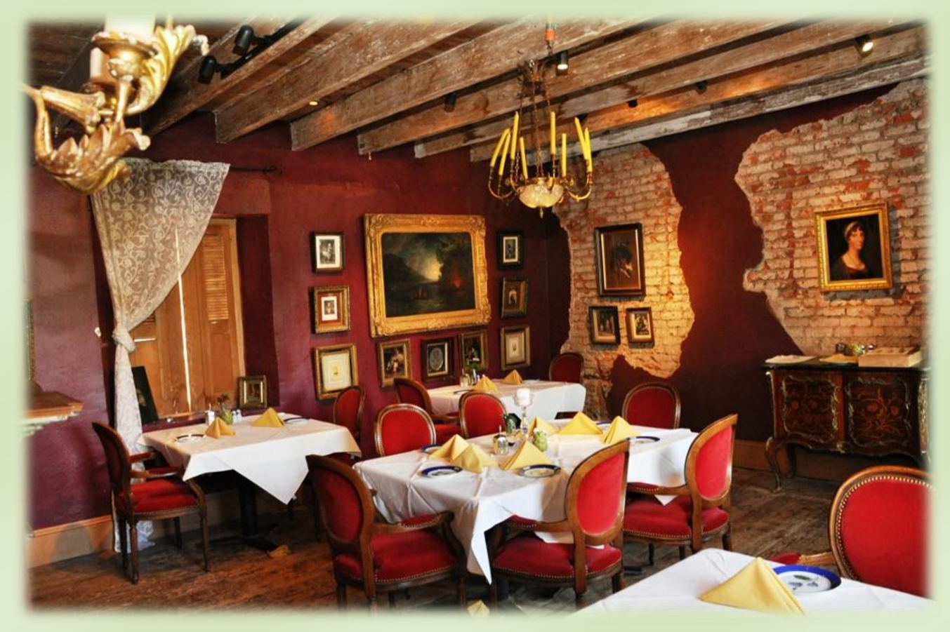
Located in the original French House, built in 1773. Featuring four exquisite rooms, each with its own personality.