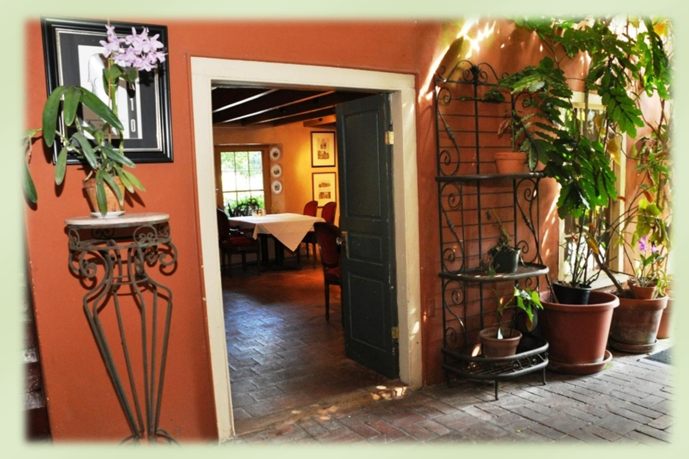
The Hunter's Room