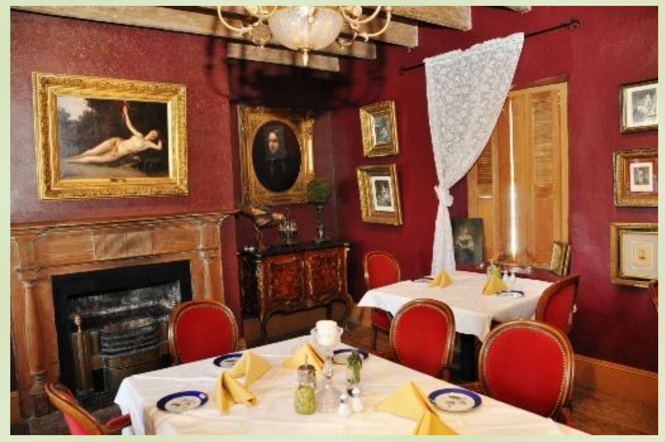
The Red Room