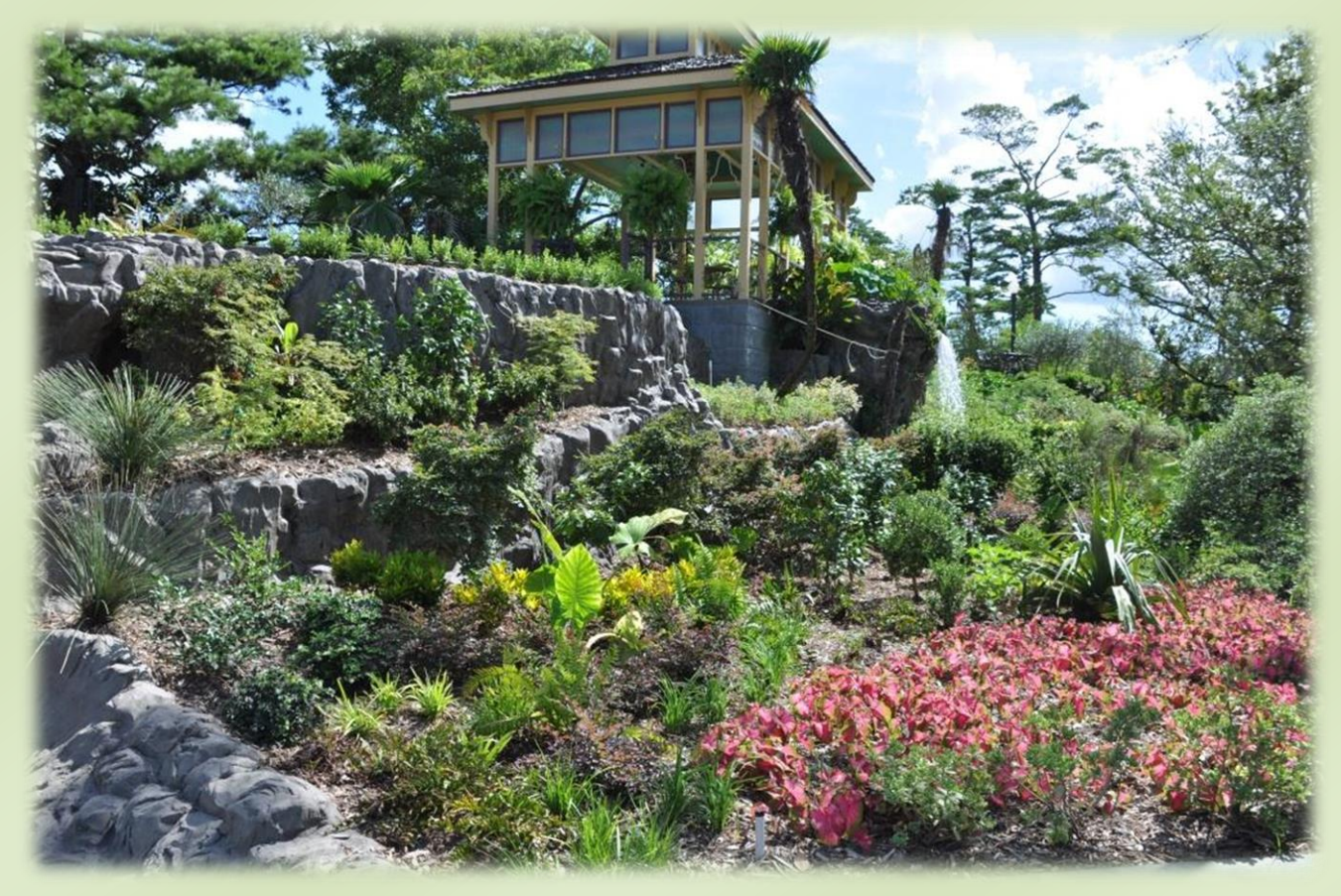
Surrounded by lush gardens, a 12 foot waterfall,