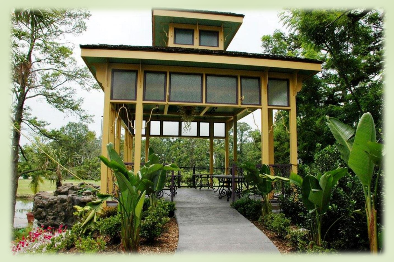
Seating for 36 in the Tea House, and 50 on the two adjacent terraces.