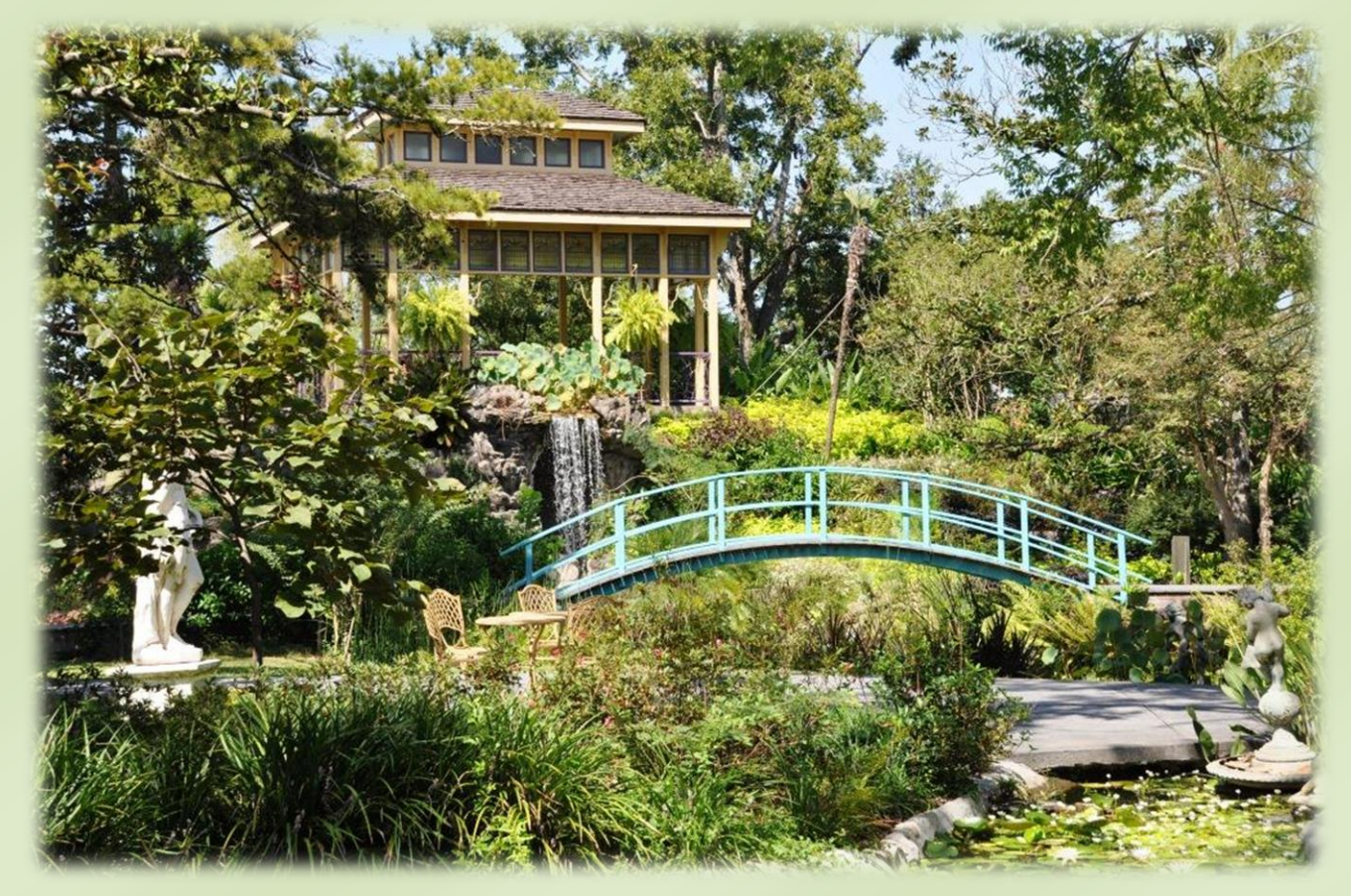
The Tea House at Mount Houmas.