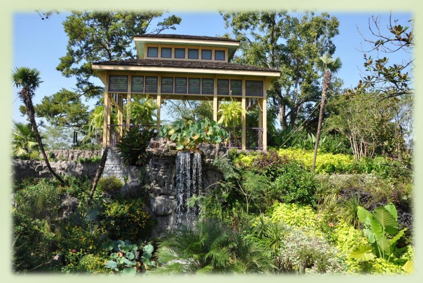
Located on the highest point of the property.