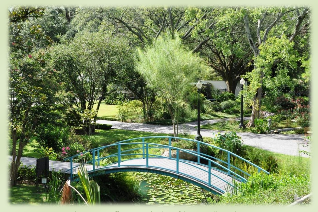
The Tea House offers spectacular views of the surrounding gardens.