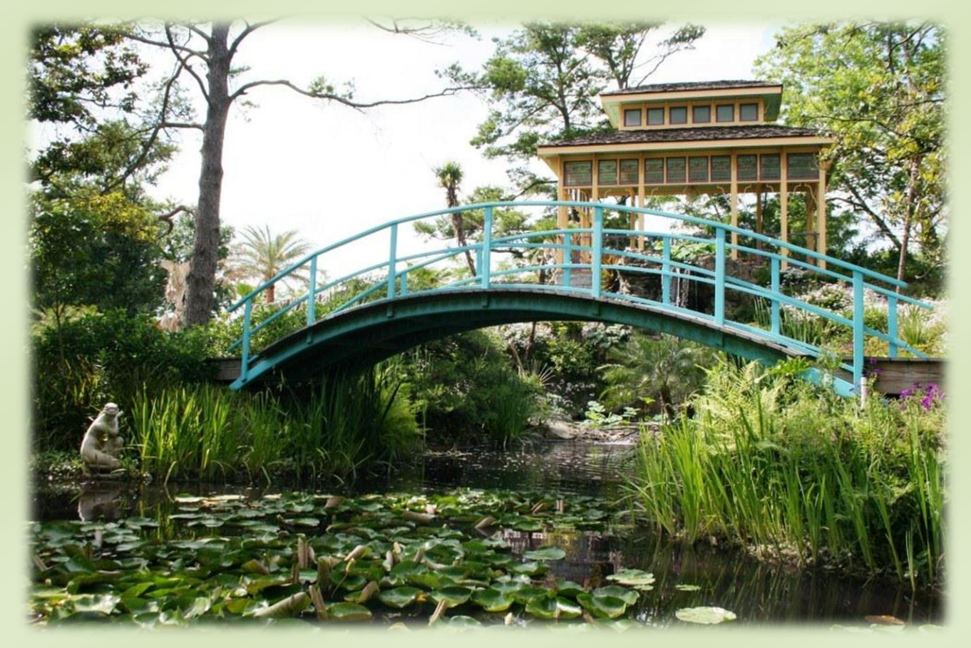
and our version of the bridge from Monet's Gardens at Giverny, France