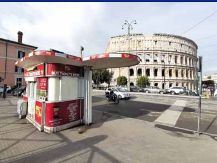
Piazza del Colosseo (Big Bus Tours/Brastours Kiosk)