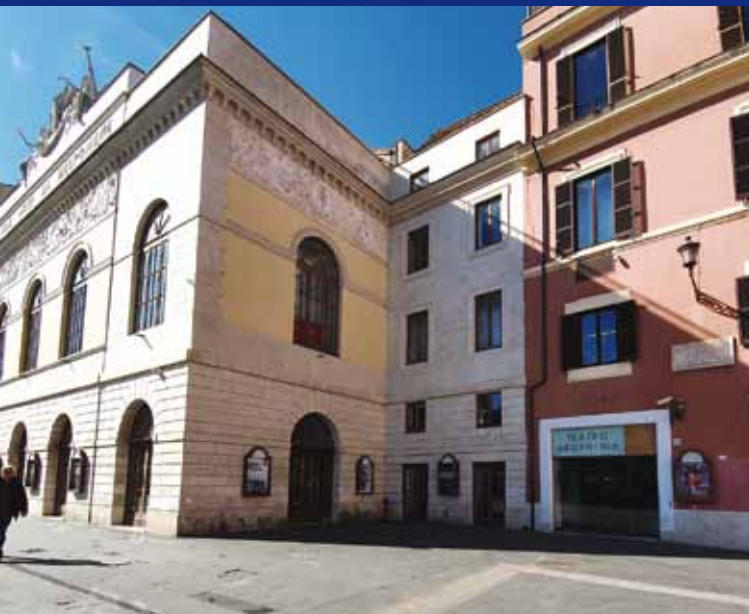
Via/Largo di Torre Argentina, 52 (Teatro Argentina)