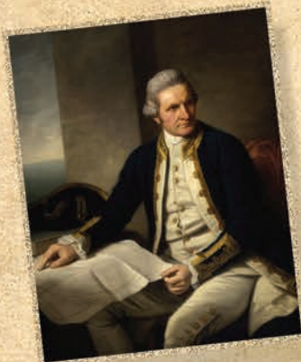
1776: Official portrait of Captain James Cook

In 1778 Captain James Cook's crew estimated the total population of the eight main Hawaiian Islands at 400,000. Cook named the Islands "The Sandwich Islands" in honor of his patron, the First Lord of Admiralty, the Earl of Sandwich.