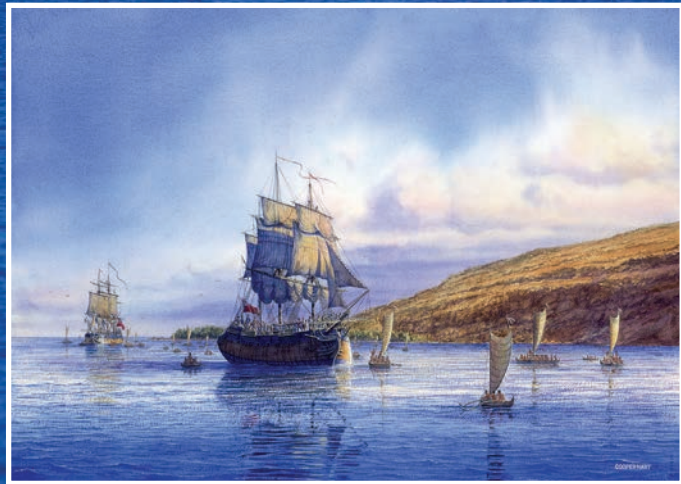
Captain Cook arriving at Kealakekua Bay - 2018

Keep an eye out for marine life as we often see spinner dolphins, mantas and seasonal humpback whales along the way.