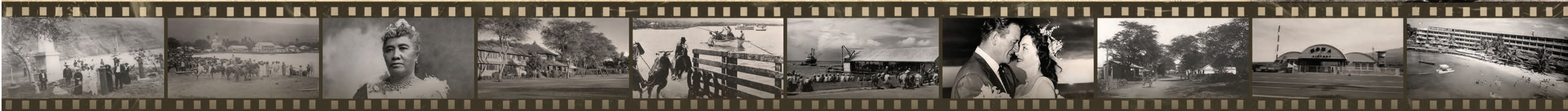
1800 Captain Cook's Monument